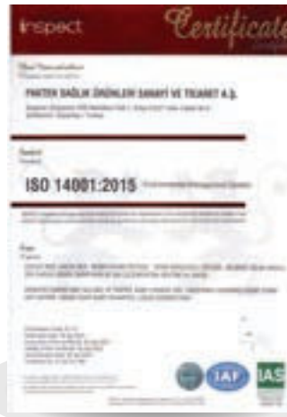
Environmental Management System ISO 14001 - 2015