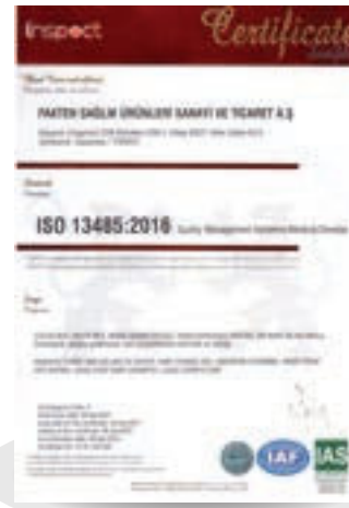
Quality Management System for Medical Devices ISO 13485 - 2016