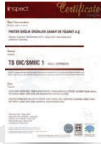
Halal Certificate TS OIC/SMIIC 1