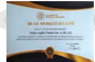
R&D Center Certification