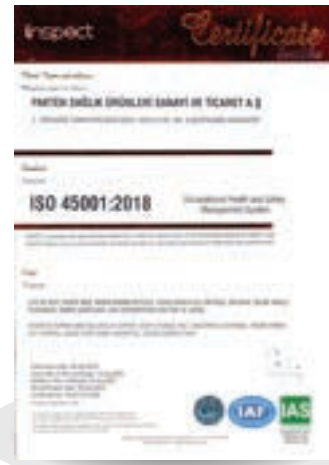
Occupational Health & Safety Management System ISO 45001 - 2018