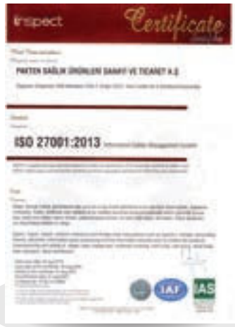
Information Security Management System ISO 27001