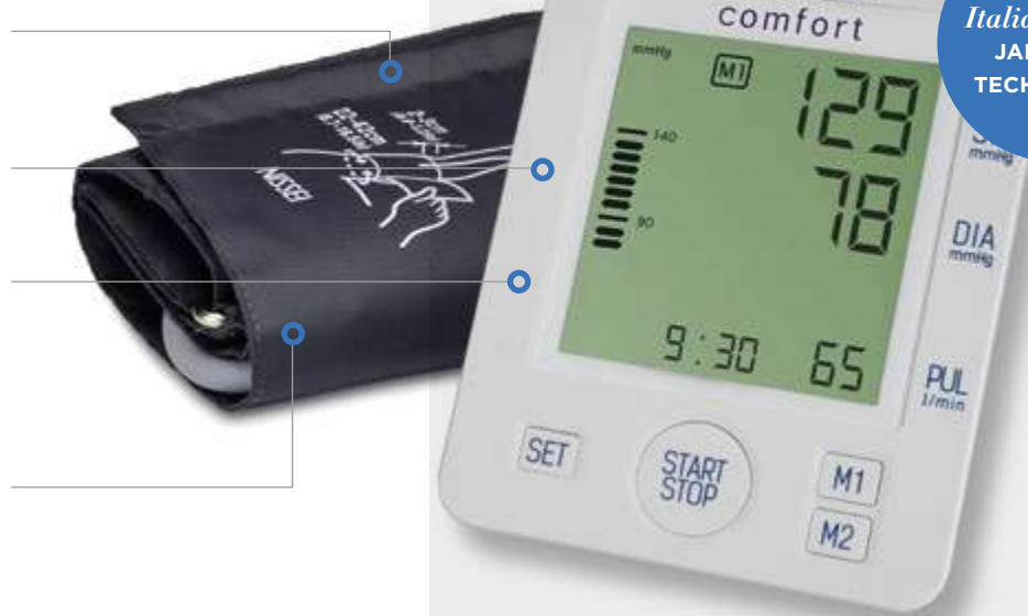
▲ Nissei Comfort, p. 22

Thanks to the inflation technology blood pressure is monitored in a gentler and quicker way during the gradual inflation of the cuff.