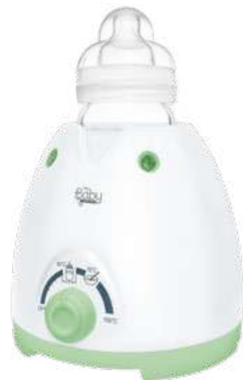
▲ Thermo Baby, p. 60

Every mum wants what's best for her baby from day one. Then it's good to know there is expert advice on hand to help take care of mums and babies during the first stage of their lives. CA-MI products will support the choices of mums in every field of babies' growth, as this company aims to help every mum to make her baby start off on the right foot.