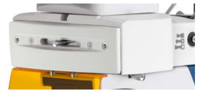
OBN 141/OBN 147

Note Semi apochromatic objectives available as accessories (see model outfit list Page 25)