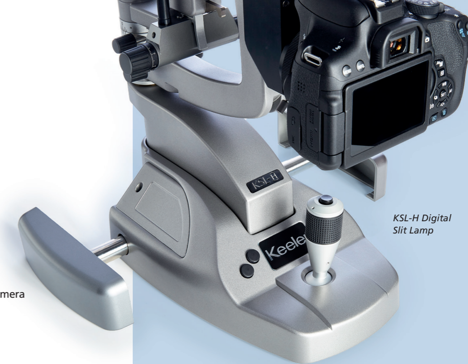
KSL-H Digital Slit Lamp