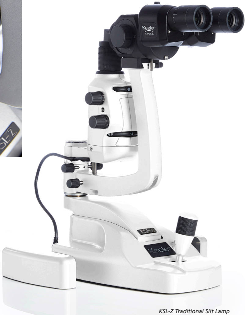
KSL-Z Traditional Slit Lamp