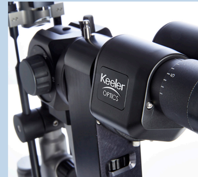
World Class Keeler Optics

Available in Traditional, Digital and Digital Ready and with a 3 or 5 step magnification.