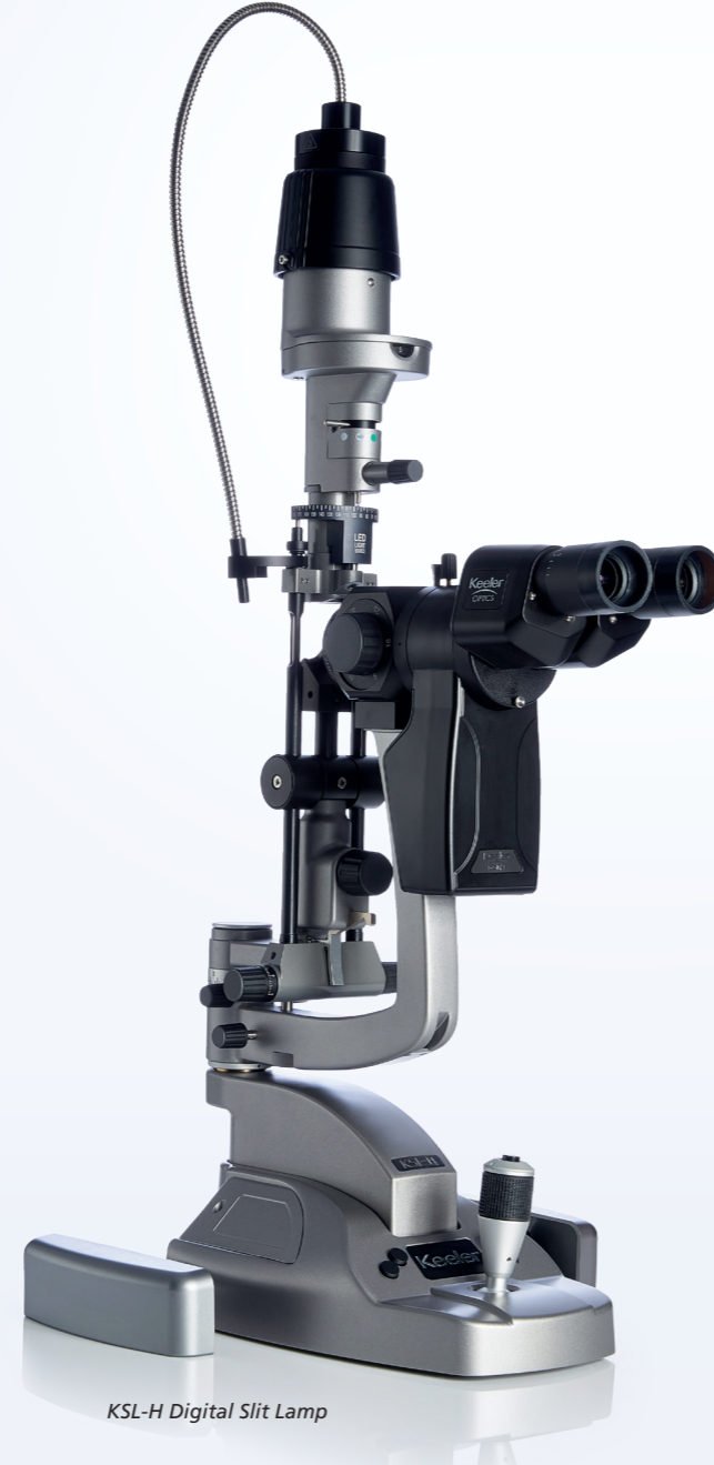
KSL-H Digital Slit Lamp