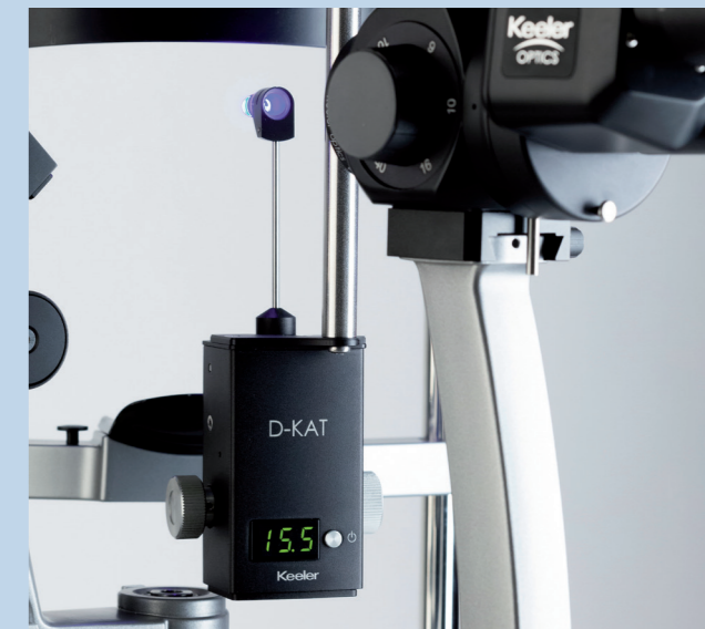
DKAT Digital Tonometer