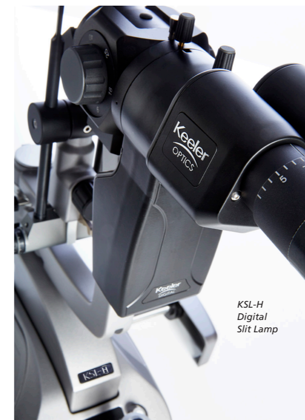
KSL-H Digital Slit Lamp

Available add-ons: digital camera, Kapture software