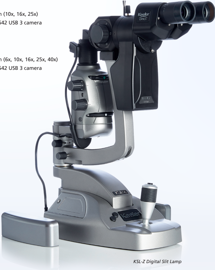
KSL-Z Digital Slit Lamp