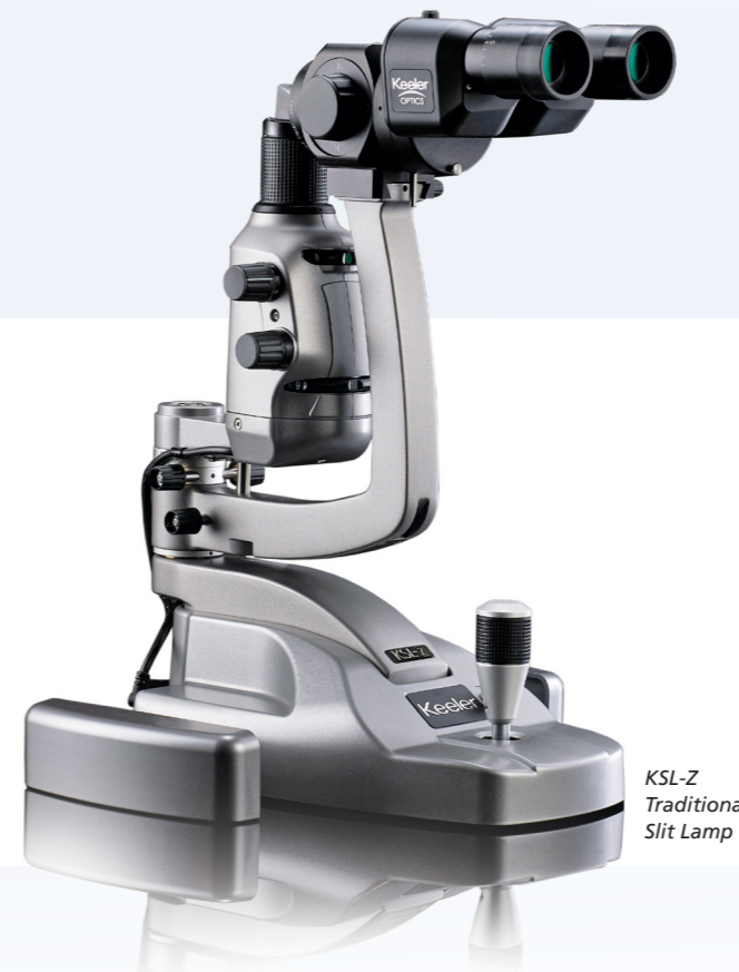
KSL-Z Traditional Slit Lamp

Available in Traditional, Digital and Digital Ready and with a 3 or 5 step magnification.