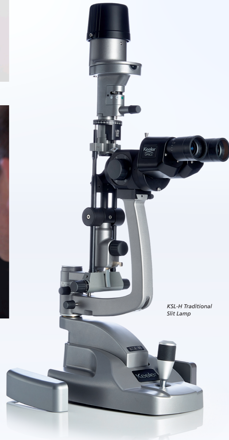
KSL-H Traditional Slit Lamp