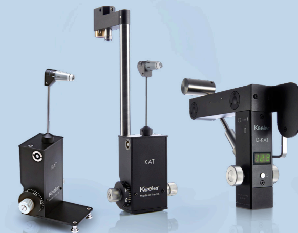
T Type KAT

THE Z TYPE is removable and mounted on the top of the drum of the KSL-Z Slit Lamp.