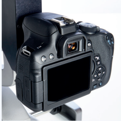
KSL-Z Digital Ready Slit Lamp with camera attachment

Lower Illumination 5 step magnification (6x, 10x, 16x, 25x, 40x) Digital Slit Lamp 3 megapixel: 2056 x 1542 USB 3 camera Kapture software