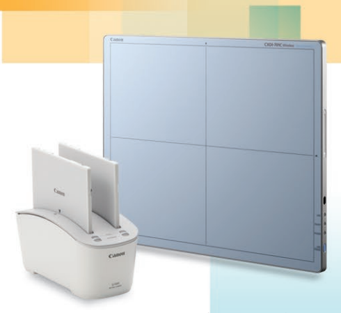
CXDI-701C Wireless System shown with optional battery charger.*