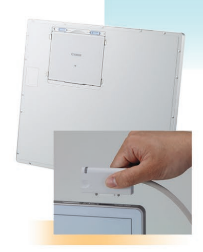
With the wired option,* the CXDI-701C Wireless System can charge the battery in the detector.