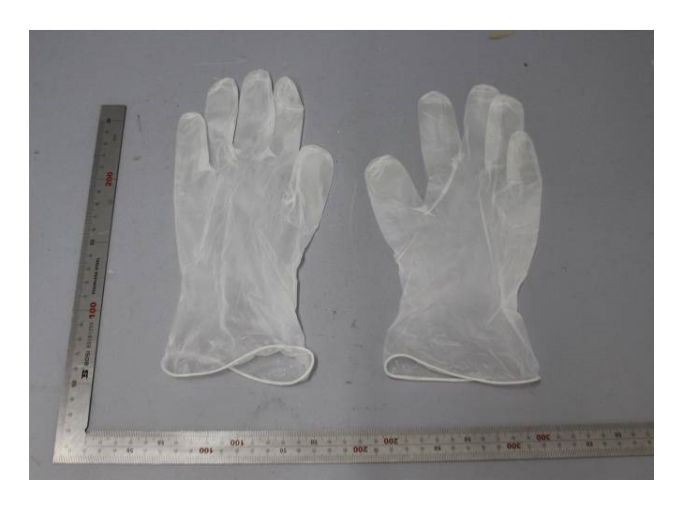
SGS authenticate the photo on original report only ***End of Report***