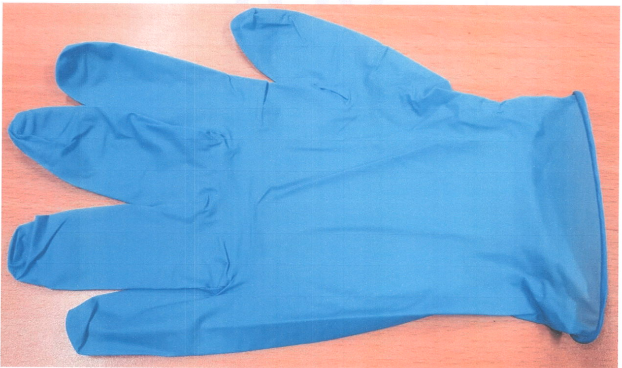
Photo : Powder Free Nitrile Examination Gloves, BS0002