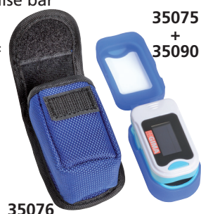
35075 + 35090