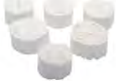
SH08 - Dental Cotton Roll Size: ø0.8cm x 3.8cm, ø1.0cm x 3.8cm, ø1.2cm x 3.8cm. Color: bleached white. Material: 100% cotton.