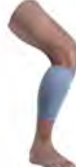
SM0106 - Shin Support (polyester) Size: S, M, L, XL. Material: polyester + latex.