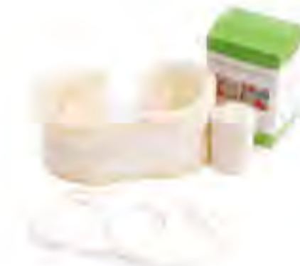
SB07 - Skin Traction Kit Size: adult, child. Color: natural white. Type: i) adhesive; ii) non-adhesive.