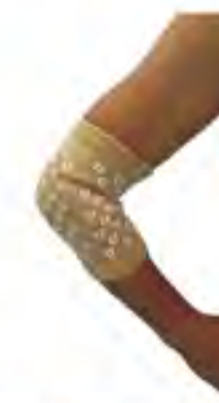
SM0702 - Elbow Support (far infrared ray) Size: S, M, L, XL. Material: polyester + latex + far infrared ray.