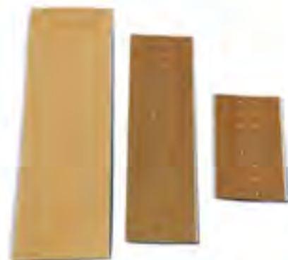
SE11 - Elastic Fabric Dressing Plaster Width: 4cm, 6cm, 8cm, etc. Length: 10cm, 25cm, 50cm, 100cm, 500cm, etc. Color: skin, white. Material: elastic fabric + glue.