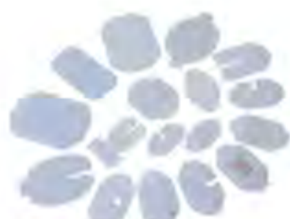
SE17 - Transparent Film Dressing Size: 4.4x4.4cm, 6x7cm, 7x10cm, 10x11.5cm, 10x12cm, 10x15cm, 10x20cm, 10x25cm, 15x20cm, 20x28cm. Color: transparent. Material: PU film + glue.