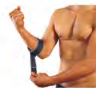
SM0505 - Elbow Support (neoprene) Size: one size fits all. Material: neoprene + nylon + silica gel.