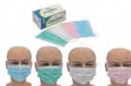
SJ05 - Non-woven Face Mask (Earloops Type) Size: 17.5 x 9.5cm. Ply: 2ply, 3ply. Color: green, blue, white, pink, etc. Material: PP non-woven + meltblown fabric. Weight: 18+20+25 g/m 2 , etc.