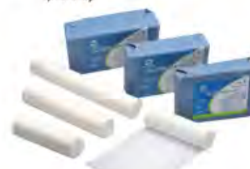
SG04 - Gauze Bandage with cutting edge (W.O.W Bandage) Size: 5cm x 5m, 7.5cm x 5m, 10cm x 5m, 15cm x 5m, etc. Mesh: 12threads/19x11mesh, 13threads/19x15mesh, 17threads/26x18mesh, 20threads/30x20mesh, etc. Color: bleached white. Material: 100% cotton (40's, 32's, 21's, etc).