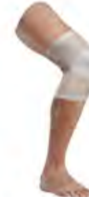
SM0203 - Knee Support (skin nylon) Size: S, M, L, XL. Material: nylon + latex + spandex.