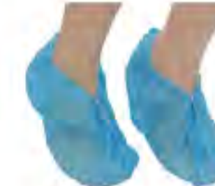
SJ27 - Non-woven Shoe Cover (manual) Size: 17 x 40cm, 17 x 45cm, 18 x 42cm, 18 x 45cm, 19 x 46cm, etc. Color: green, blue, white, pink, etc. Material: PP non-woven. Weight: 35g/m 2 , 40g/m 2 , etc. Type: normal, anti-skid.