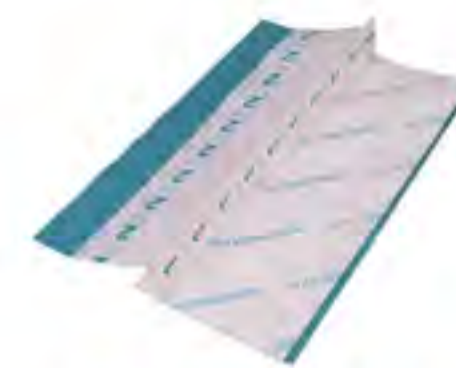
SE21 - PU Surgical Incise Film Size: 15x28cm, 20x30cm, 30x28cm, 30x40cm, 40x42cm, 45x28cm, 45x55cm, 55x55cm, 56x84cm, etc. Color: transparent. Material: PU film + glue.