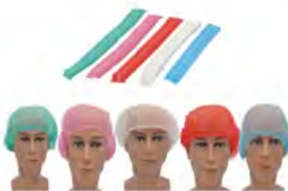
SJ02 - Mob Cap (Clip Cap, Strip Cap) Size: 18", 19", 21", 24", etc. Color: blue, green, white, pink, red, etc. Material: PP non-woven. Weight: 10 - 20 g/m 2 .