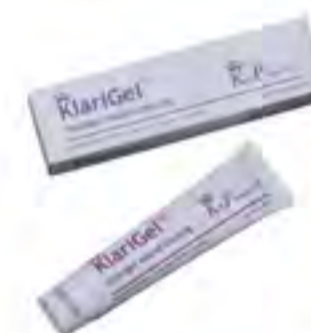
SF11 - Hydrogel Dressing Size: 5x5cm, 10x10cm, 10x20cm, 15x15cm, 15g, 42g, 85g, etc. Material: hygroscopic macromolecules gelatin.