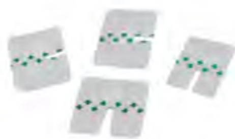
SE19 - PU I.V. Dressing Size: 6x7cm, 6x8cm. Color: transparent. Material: PU film + glue.