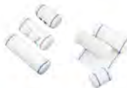
SA03 - Cotton Crepe Bandage Size: 5cm x 4m, 7.5cm x 4m, 10cm x 4m, 15cm x 4m. Weight: 75g/m 2 , 80g/m 2 . Color: natural white, bleached white. Material: 100% cotton.