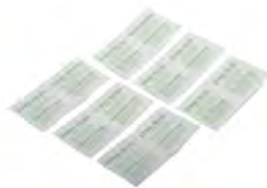
SI03 - Sting Relief Medicated Pad Size: 30x60mm-2ply, etc.