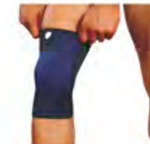
SM0305 - Knee Support with Metal Sping (pattern nylon) Size: S, M, L, XL. Material: nylon + latex + spandex + metal sping.