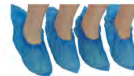
SJ28 - CPE Shoe Cover Size: 15 x 38cm, 15 x 41cm, etc. Color: green, blue, white, etc. Material: CPE. Weight: 2g/pc, 2.5g/pc, 3g/pc, 3.5g/pc, 4g/pc, etc.