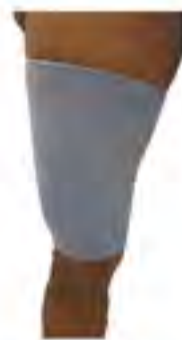
SM0105 - Thigh Support (polyester) Size: S, M, L, XL. Material: polyester + latex.