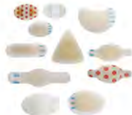
SF05 - Hydrocolloid Blister Plaster Size: 28x46mm, 35x54mm, 44x69mm, 18x52mm, 20x60mm, 28x69mm, 50x50mm, etc. Material: pressure sensitive adhesive + CMC.