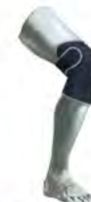
SM0508 - Knee Support (neoprene) Size: one size fits all. Material: neoprene + nylon + spandex.