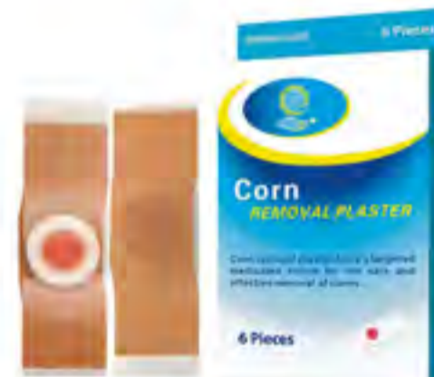
SF22 - Corn Plaster Size: 66x16mm, etc. Color: skin. Material: PE + glue.