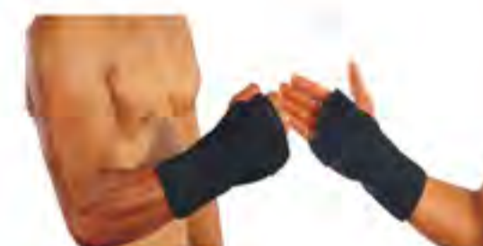
SM0803 - Wrist Support with Aluminium Alloy Holder Size: one size fits all. Material: mesh fabric + foam + velvet + aluminium alloy holder.