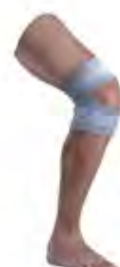
SM0603 - Knee Wrap Size: one size fits all. Material: polyester + latex.