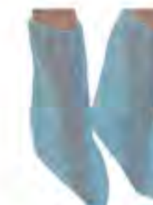
SJ29 - Non-woven Boot Cover Size: 38 x 40cm, 40 x 50cm, etc. Color: blue, green, white, etc. Material: PP non-woven. Weight: 25g/m 2 , 30g/m 2 , 35g/m 2 , 40g/m 2 , etc.