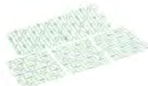
SE16 - PU Wound Dressing (without absorbent pad) Size: 4x5cm, 6x7cm, 9x10cm, 10x12cm, 10x14cm, 10x20cm, etc. Color: transparent. Material: PU film + glue.