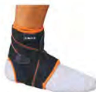
SM0516 - Ankle Support with Metal Spring (neoprene) Size: one size fits all. Material: neoprene + nylon + spandex + metal spring.