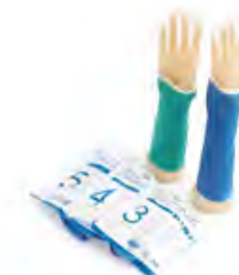
SB02 - Orthopedic Casting Tape Size: 5cm x 3.6m, 7.5cm x 3.6m, 10cm x 3.6m, 12.5cm x 3.6m, 15cm x 3.6m. Color: white, blue, green, pink, red, yellow, orange, etc. Type: i) fiberglass; ii) polyester.