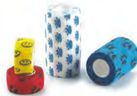
SC05 - Cohesive Elastic Bandage (Pets Type) Size: 2.5cm x 4.5m, 5cm x 4.5m, 7.5cm x 4.5m, 10cm x 4.5m, 15cm x 4.5m. Color: pet pattern. Material: non-woven + elastic yarn + glue.