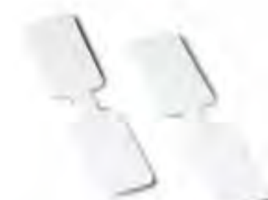
SE25 - Butterfly Closure Size: 45x10mm, 72x12mm. Color: white. Material: cotton fabric composited with PE + glue.