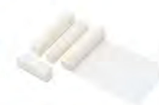
SG05 - Gauze Bandage with woven edge Size: 5cm x 4.5m, 7.5cm x 4.5m, 10cm x 4.5m, 15cm x 4.5m, etc. Mesh: 13threads/19x15mesh, 17threads/24x20mesh, 20threads/30x20mesh, etc. Color: bleached white. Material: 100% cotton (40's, 32's, 21's, etc).