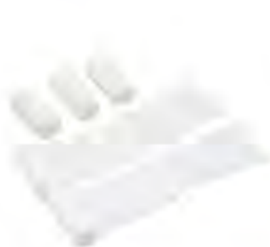
SA08 - PBT First Aid Bandage Size: 4cm x 2.5m (pad 4cm x 6cm), 6cm x 2.5m (pad 6cm x 8cm), 8cm x 2.5m (pad 8cm x 10cm), 10cm x 2.5m (pad 10cm x 12cm). Color: bleached white. Material: conforming bandage + non-adherent pad.