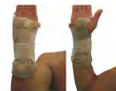
SM0804 - Wrist Support with Aluminium Alloy Holder Size: one size fits all. Material: polyester + leather + aluminium alloy holder.