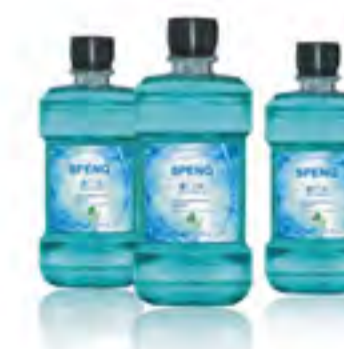
SI16 - Mouthwash Size: 250ml, 500ml, etc. Smell: apple, lemon, menthol, etc.