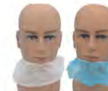
SJ33 - Non-woven Beard Cover Size: 18", 19", 21", etc. Color: blue, green, white, etc. Material: PP non-woven. Weight: 10 - 14 g/m 2 .