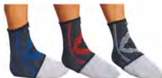
SM0308 - Ankle Support (pattern nylon) Size: S, M, L, XL. Material: nylon + latex + spandex.