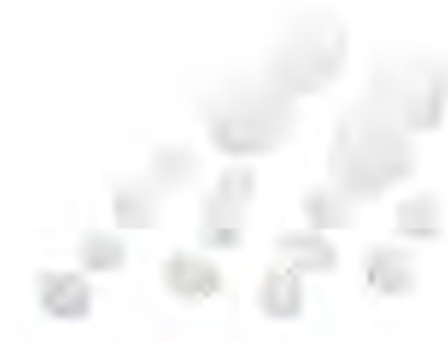
SG21 - Gauze Balls Size: 15x15cm, 20x20cm, 25x25cm, 30x30cm, 30x40cm, 40x50cm, etc. Mesh: 17threads/26x18mesh, 20threads/30x20mesh, etc. Color: bleached white. Material: 100% cotton (40's, 32's, 21's, etc). Type: with or without x-ray.