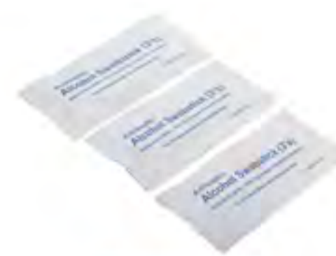
SI09 - Alcohol Swabstick Size: ø10mm x 4", Packaging: 1pc/pouch, 2pcs/pouch, 3pcs/pouch.