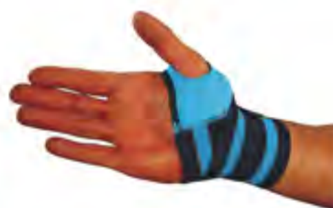
SM0502 - Wrist Support (neoprene) Size: one size fits all. Material: neoprene + nylon.