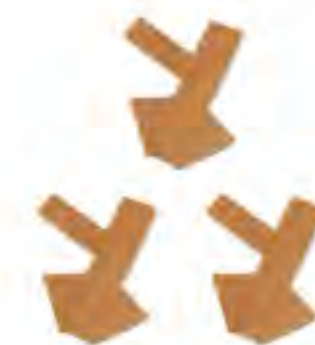
SE27 - Nasal Cannula Fixation Plaster Size: 36x40mm, 59x62mm, 70x71mm. Color: skin. Material: non-woven + glue.