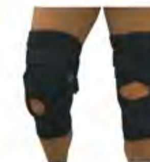
SM0512 - Knee Support with Aluminium Alloy Holder (neoprene) Size: one size fits all. Material: neoprene + nylon + aluminium alloy holder.