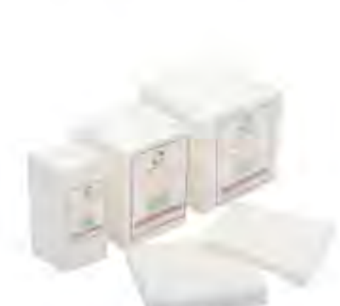
SG09 - Non-sterile Non-woven Swabs Size: 5x5cm, 7.5x7.5cm, 10x10cm, 10x20cm, etc. Ply: 4ply, 6ply, 8ply. Weight: 30g/m 2 , 40g/m 2 , etc. Color: bleached white. Material: polyester + viscose. Type: i)without x-ray; ii)with x-ray.