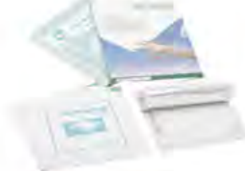
SG22 - Paraffin Gauze Size: 5x5cm, 7.5x7.5cm, 10x10cm, 10x20cm, 20x20cm, etc. Color: white, yellow. Material: gauze + vaseline, etc.