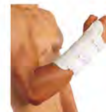
SM0801 - Wrist Support with Aluminium Alloy Holder Size: one size fits all. Material: mesh fabric + foam + velvet + aluminium alloy holder.