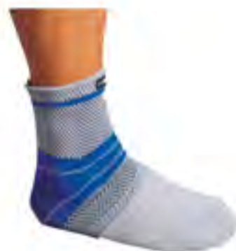
SM0404 - Ankle Support (silica gel) Size: S, M, L, XL. Material: nylon + latex + spandex + silica gel.