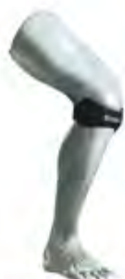
SM0513 - Patella Tendon Strap (neoprene) Size: one size fits all. Material: neoprene + nylon.