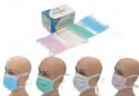
SJ06 - Non-woven Face Mask (Ties Type) Size: 17.5 x 9.5cm. Ply: 2ply, 3ply. Color: green, blue, white, pink, etc. Material: PP non-woven + meltblown fabric. Weight: 18+20+25 g/m 2 , etc.