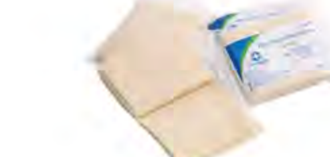
SG25 - Triangular Bandage Size: 36"x36"x51", 40"x40"x56", etc. Mesh: 48x48mesh, 48x30mesh, etc. Color: natural white. Material: 100% cotton.