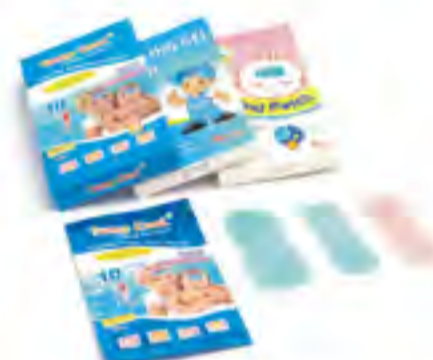
SF20 - Cooling Gel Patch Size: 4x10cm, 5x12cm, etc. Color: blue, red, green, yellow, etc. Smell: apple, orange, menthol, candy, etc. Material: non-woven + hydrogel, menthol, borneol, etc.