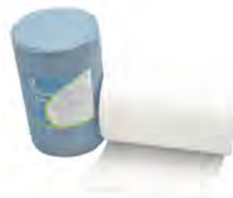
SG01 - Absorbent Gauze Roll Size: 90cm x 100yds, 90cm x 100m, 90cm x 50yds, 90cm x 50m, 90cm x 2000m, etc. Ply: 4ply, 2ply, 1ply. Mesh: 8threads/12x8mesh, 12threads/19x11mesh, 13threads/19x15mesh, 17threads/26x18mesh, 20threads/30x20mesh, etc. Color: bleached white. Material: 100% cotton (40's, 32's, 21's, etc). Type: i)without x-ray; ii)with x-ray.