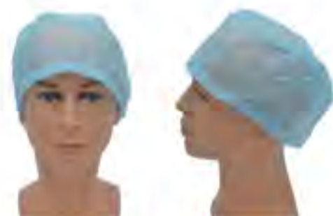
SJ04 - Doctor Cap (Surgeon Cap) - Elastic Type Size: 64x13cm, etc. Color: blue, green, etc. Material: PP non-woven. Weight: 20 - 30 g/m 2 .