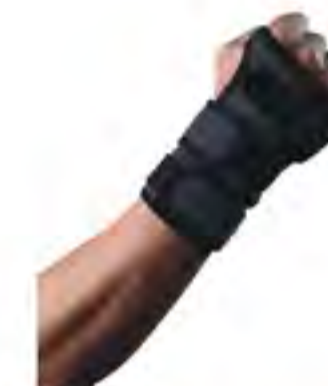
SM0802 - Wrist Support with Aluminium Alloy Holder Size: one size fits all. Material: nylon + foam + polyester + neoprene + aluminium alloy holder.