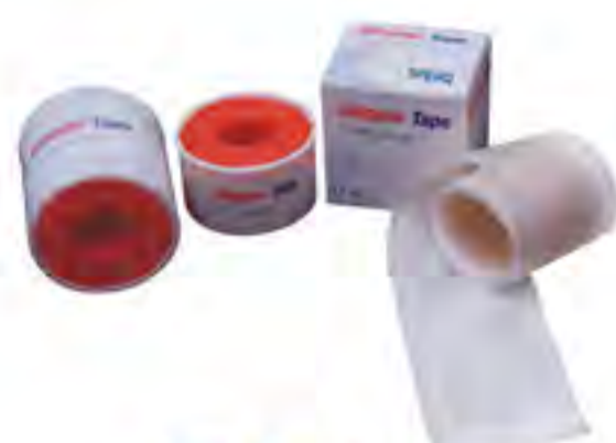
SF17 - Silicone Tape Size: 2.5cm x 1.5cm, 3.5cm x 1.5cm, 4cm x 1.5cm, 7.5cm x 1.5cm, 2.5cm x 5m, 5cm x 5m, etc. Material: PU film + silicone gel.