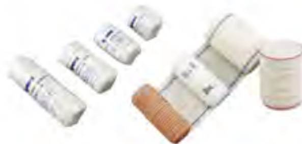
SA02 - Spandex Crepe Bandage Size: 5cm x 4.5m, 7.5cm x 4.5m, 10cm x 4.5m, 15cm x 4.5m. Weight: 65g/m 2 , 70g/m 2 , 75g/m 2 . Color: natural white, bleached white, skin. Material: cotton + spandex.