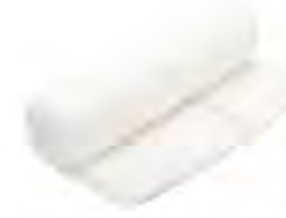
SG20 - Non-woven Abdominal Roll Width: 10cm, 15cm, 20cm, etc. Length: 1m, 1.5m, 2m, etc. Color: white, blue, green. Material: non-woven + wood pulp.