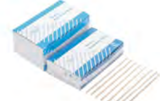
SH17 - Wooden applicator sticks Material: wooden. Size: 500pcs, 1000pcs, etc. Packaging: paper box.