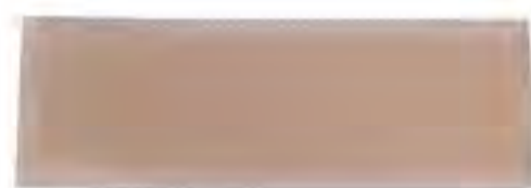
SF18 - Silicone Gel Sheet Size: 2x12cm, 3x12cm, 4x30cm, 5x7.5cm, 5x18cm, 6x12cm, 10x18cm, 12x15cm, etc. Material: PU film + silicone gel.