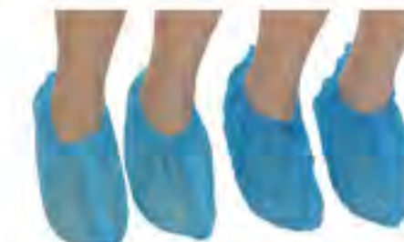
SJ26 - Non-woven Shoe Cover (full rubber band) Size: 17 x 41cm, 18 x 42cm, 18 x 45cm, etc. Color: green, blue, white, pink, etc. Material: PP non-woven. Weight: 25g/m 2 , 30g/m 2 , 35g/m 2 , etc. Type: normal, anti-skid.