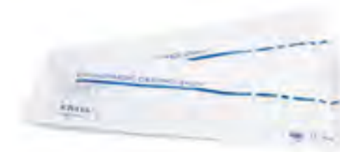
SB03 - Orthopedic Splint Size: 7.5cm x 30cm, 7.5cm x 90cm, 10cm x 40cm, 10cm x 75cm, 12.5cm x 75cm, 12.5cm x 115cm, 15cm x 75cm, 15cm x 115cm. Color: white. Type: i) fiberglass; ii) polyester.