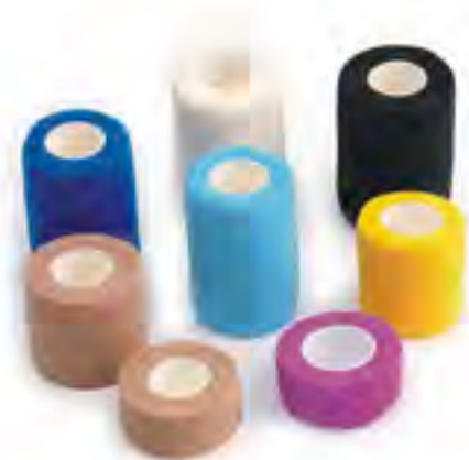
SC01 - Cohesive Elastic Bandage (Non-woven Type) Size: 2.5cm x 4.5m, 5cm x 4.5m, 7.5cm x 4.5m, 10cm x 4.5m, 15cm x 4.5m. Color: skin, white, blue, green, pink, red, yellow, orange, black, etc. Material: non-woven + elastic yarn + glue.