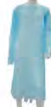
SJ24 - CPE Gown Size: 108 x 172cm(S), 110 x 193cm(M), 116 x 202cm(L), etc. Color: blue, green, yellow, white, pink, etc. Material: CPE. Weight: 35g/pc, 40g/pc, 45g/pc, etc.