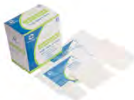
SE14 - Non-woven Wound Dressing Size: 5x7cm, 6x8cm, 10x10cm, 10x12cm, 10x15cm, 10x20cm, 10x25cm, 10x30cm, 10x35cm, etc. Color: white. Material: non-woven + glue.