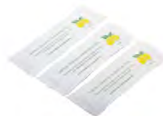
SI12 - Lemon Glycerine Swabstick Size: ø10mm x 4", Packaging: 1pc/pouch, 2pcs/pouch, 3pcs/pouch.