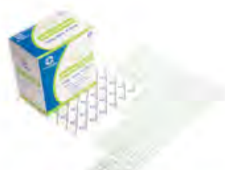
SE15 - PU Wound Dressing Size: 5x7cm, 6x8cm, 10x10cm, 10x12cm, 10x15cm, 10x20cm, 10x25cm, 10x30cm, 10x35cm, etc. Color: transparent. Material: PU film + glue.