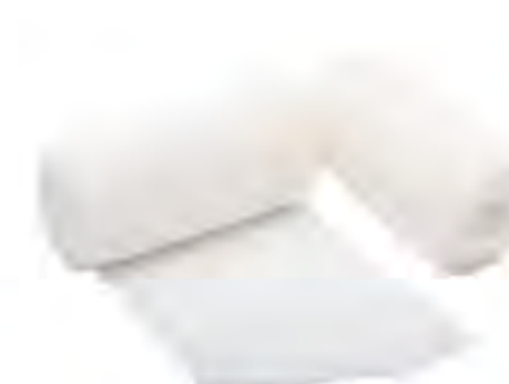
SG03 - Crinkle Gauze Roll Size: 4.5" x 4.1yds, etc. Mesh: 8threads/12x8mesh, 12threads/19x11mesh, etc. Color: bleached white. Material: 100% cotton (40's, 32's, 21's, etc).