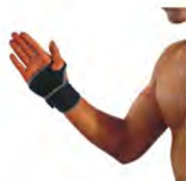
SM0501 - Wrist Support (neoprene) Size: one size fits all. Material: neoprene + nylon.