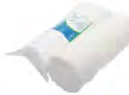
SH04 - Coreless Cotton Wool Size: 400g, 454g, 500g, etc. Color: bleached white. Material: 100% cotton.