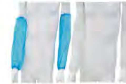
SJ32 - PE Sleeve Cover Size: 40 x 20cm, 46 x 22cm, 48 x 25cm, etc. Color: blue, green, white, etc. Material: PE. Weight: 2.8g/pc, etc.