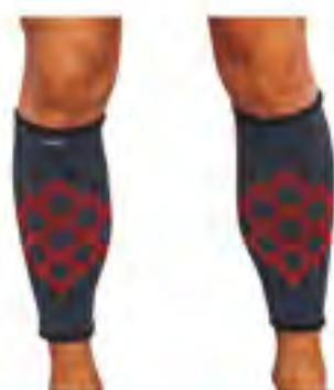
SM0307 - Shin Support (pattern nylon) Size: S, M, L, XL. Material: nylon + latex + spandex.