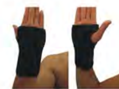
SM0805 - Wrist Support with Aluminium Alloy Holder Size: one size fits all. Material: nylon + polyester + neoprene + aluminium alloy holder.