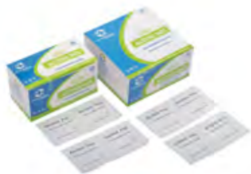
SI01 - Alcohol Pad Size: 30x60mm-2ply, 60x60mm-4ply, etc.