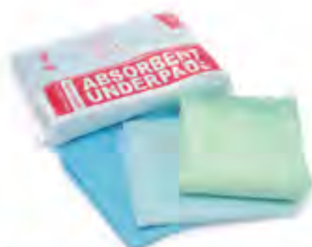
SK01 - Absorbent Underpad Size: 40 x 60cm, 60 x 60cm, 60 x 90cm, 76 x 76cm, 76 x 90cm, 80 x 180cm, etc. Color: blue, green, white, etc. Material: PE + PP + paper + wood pulp + SAP. Weight: 20 - 110 g/pc.