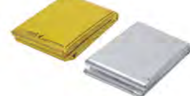
SG26 - Emergency Blanket Size: 160x210cm, 135x200cm, etc. Color: gold, silver, gold+silver. Material: aluminum foil.