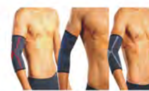
SM0302 - Elbow Support (pattern nylon) Size: S, M, L, XL. Material: nylon + latex + spandex.