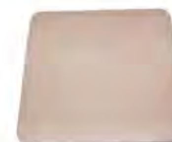
SF15 - Silicone Foam Dressing Size: 5x5cm, 10x10cm, 12.5x12.5cm, 15x15cm, 15x20cm, 10x17.5cm, 15x18cm, etc. Material: polyurethane + silicone gel + PU film.