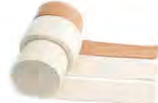
SB05 - Tubular Bandage Width: A#(4.5cm), B#(6.5cm), C#(6.75cm), D#(7.5cm), E#(8.75cm), F#(10cm), G#(12cm), H#(17.5cm), I#(21.5cm), J#(32.5cm), etc. Length: 10m, etc. Color: natural white, skin. Material: cotton + rubber.