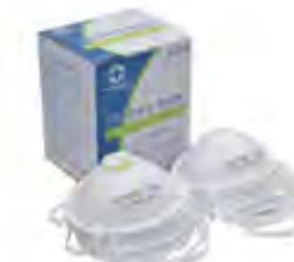
SJ11 - N95 Face Mask (Round Cup Type) Size: standard. Ply: 3ply, 4ply. Color: white. Material: PP non-woven + meltblown fabric + polyester. Type: with or without valve, with or without active carbon.