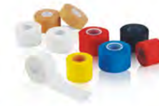
SC12 - Sport Tape Size: 2.5cm x 10yds, 3.8cm x 10yds, 5.0cm x 10yds, 2.5cm x 15yds, 3.8cm x 15yds, 5.0cm x 15yds. Color: white, skin, yellow, blue, green, red, black, etc. Material: cotton + glue.