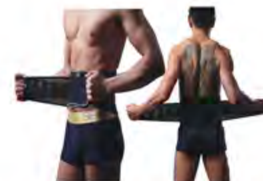
SM0507 - Waist Support with Metal Sping (neoprene) Size: one size fits all. Material: neoprene + nylon + spandex + metal sping.