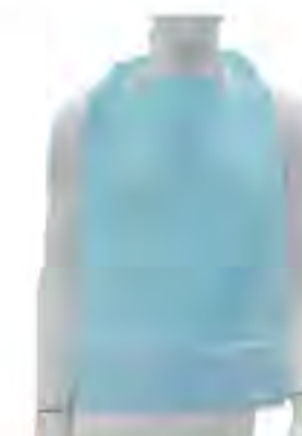
SK10 - Dental Apron Size: 37 x 66cm, 37 x 51cm, 37 x 54cm, 38 x 57cm, 40 x 50cm, etc. Color: blue, green, white, etc. Material: paper + PE film. Weight: 40g/m 2 , etc.