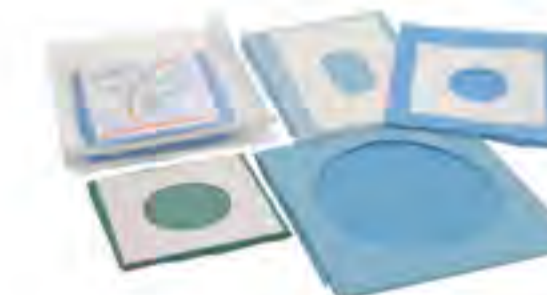
SK12 - Surgical Drape with hole Size: 50 x 50cm, 50 x 60cm, 60 x 60cm, 75 x 75cm, 90 x 90cm, etc. Color: blue, green, white, etc. Material: SMS, PP + PE, impregnated cloth + PE, etc. Type: adhesive or non-adhesive.