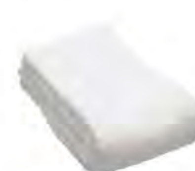
SG02 - Zig-zag Gauze Size: 90cm x 100yds, 90cm x 100m, 65cm x 5m, etc. Mesh: 8threads/12x8mesh, 12threads/19x11mesh, 13threads/19x15mesh, 17threads/26x18mesh, 20threads/30x20mesh, etc. Color: bleached white. Material: 100% cotton (40's, 32's, 21's, etc). Type: i)without x-ray; ii)with x-ray.