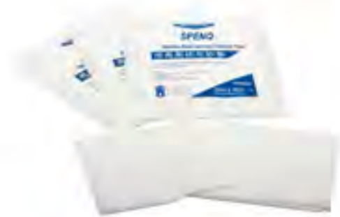
SG10 - Sterile Non-woven Swabs Size: 5x5cm, 7.5x7.5cm, 10x10cm, 10x20cm, etc. Ply: 4ply, 6ply, 8ply. Weight: 30g/m 2 , 40g/m 2 , etc. Color: bleached white. Material: polyester + viscose. Type: i) without x-ray; ii) with x-ray. Individual packaging: 1pc/pouch, 2pcs/pouch, 5pcs/pouch, etc.