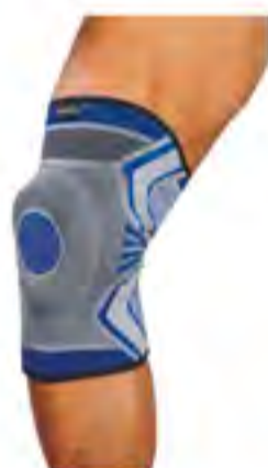
SM0402 - Knee Support with Metal Sping (silica gel) Size: S, M, L, XL. Material: nylon + latex + spandex + silica gel + metal sping.