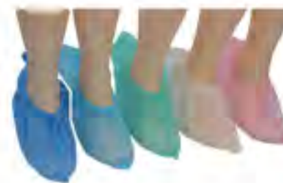
SJ25 - Non-woven Shoe Cover Size: 17 x 41cm, 18 x 42cm, 18 x 45cm, etc. Color: green, blue, white, pink, etc. Material: PP non-woven. Weight: 25g/m 2 , 30g/m 2 , 35g/m 2 , etc. Type: normal, anti-skid.