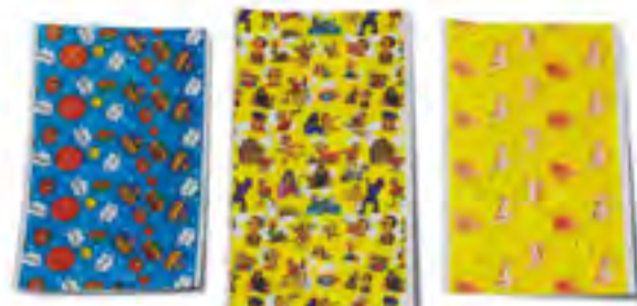
SE13 - Cartoon Dressing Plaster Width: 4cm, 6cm, 8cm, etc. Length: 10cm, 25cm, 50cm, 100cm, 500cm, etc. Color: cartoon pattern. Material: cartoon PE + glue.