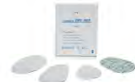
SE22 - Adhesive Eye Pad Size: 80x58mm, 95x65mm, etc. Color: white. Material: non-woven + glue.