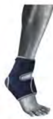
SM0514 - Ankle Support (neoprene) Size: one size fits all. Material: neoprene + nylon.