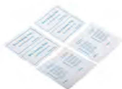
SI05 - Wet Cleaning Wipe Size: 120x150mm-24ply, 120x200mm-32ply, etc.