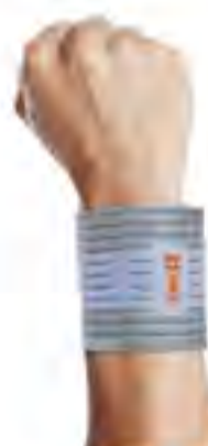
SM0601 - Wrist Wrap Size: one size fits all. Material: polyester + latex.