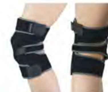
SM0509 - Knee Support with Metal Sping (neoprene) Size: one size fits all. Material: neoprene + nylon + spandex + metal sping.