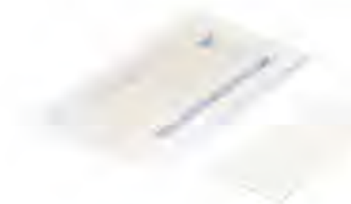
SE24 - Wound Skin Closure Size: 3x75mm, 6x38mm, 6x75mm, 6x100mm, 12x50mm, 12x100mm, 12x125mm, 25x100mm, etc. Color: white, skin. Type: i)non-woven; ii)PU.