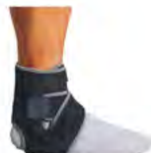
SM0515 - Ankle Support with Metal Spring (neoprene) Size: one size fits all. Material: neoprene + nylon + metal spring.