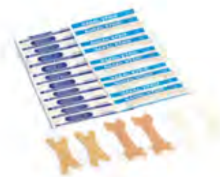
SE26 - Nasal Strip Size: 55x18mm, 66x19mm, etc. Color: skin, transparent. Type: i)non-woven; ii)PE.