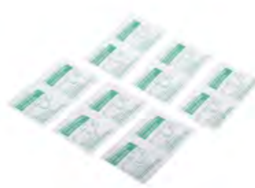
SI06 - Lens Cleaning Towelette Size: 120x150mm-24ply, 120x200mm-32ply, etc.