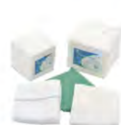
SG07 - Non-sterile Gauze Swabs Size: 5x5cm, 7.5x7.5cm, 10x10cm, 10x20cm, etc. Ply: 8ply, 12ply, 16ply, 24ply, 32ply. Edge: unfolded edge, folded edge. Mesh: 8threads/12x8mesh, 12threads/19x11mesh, 13threads/19x15mesh, 17threads/26x18mesh, 20threads/30x20mesh, etc. Color: bleached white. Material: 100% cotton (40's, 32's, 21's, etc). Type: i)without x-ray; ii)with x-ray.