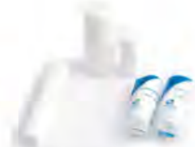
SA05 - Conforming Bandage (Thin PBT) Size: 5cm x 4m, 7.5cm x 4m, 10cm x 4m, 15cm x 4m. Weight: 30g/m 2 . Color: bleached white. Material: 100% polyester.