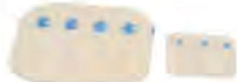
SF02 - Hydrocolloid Dressing (extra thin) Size: 5x5cm, 10x10cm, 15x15cm, 15x20cm, 20x20cm, etc. Material: pressure sensitive adhesive + CMC.