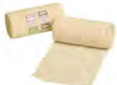
SA06 - Ideal Bandage (Thick PBT) Size: 5cm x 4m, 7.5cm x 4m, 10cm x 4m, 15cm x 4m. Weight: 60g/m 2 . Color: natural white. Material: polyester + cotton.