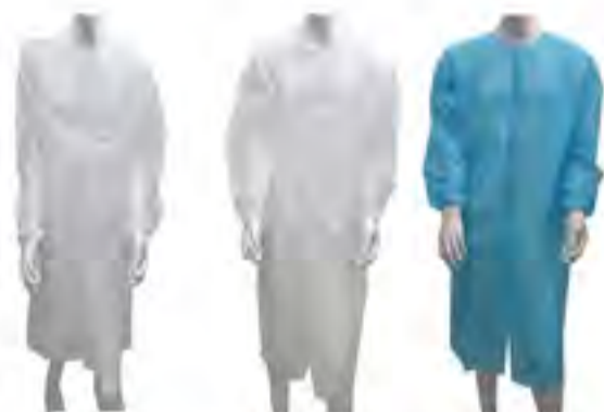
SJ19 - Lab Coat Size: 110 x 130cm(S), 115 x 137cm(M), 120 x 140cm(L), 125 x 145cm(XL), 130 x 150cm(XXL), etc. Color: white, blue, green, yellow, etc. Material: PP non-woven. Weight: 30g/m 2 , 35g/m 2 , 40g/m 2 , etc.