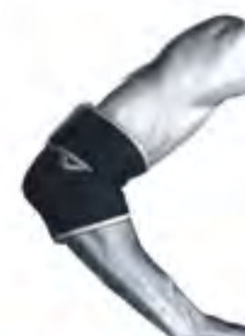
SM0504 - Elbow Support (neoprene) Size: one size fits all. Material: neoprene + nylon.