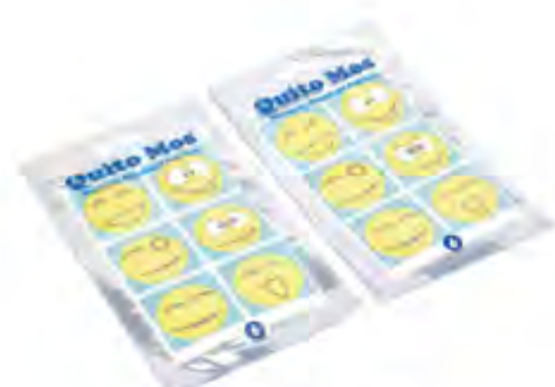
SF21 - Mosquito Repellent Patch Size: ø27mm, ø30mm, ø38mm, etc. Color: yellow, blue, white. Material: non-woven + mosquito natural plant extracts, polymer gel, etc.