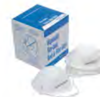
SJ10 - Dust Mask Size: standard. Ply: 1ply. Color: white. Material: PP non-woven. Weight: 120g/m 2 , 140g/m 2 , 160g/m 2 , 180g/m 2 , etc.