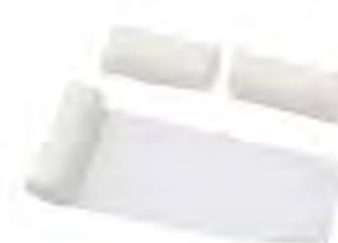
SG06 - Crochet Gauze Bandage Size: 5cm x 5m, 7.5cm x 5m, 10cm x 5m, 15cm x 5m, etc. Weight: 36g/m 2 , 70g/m 2 , etc. Color: bleached white. Type: i)100% cotton; ii)100% polyester.