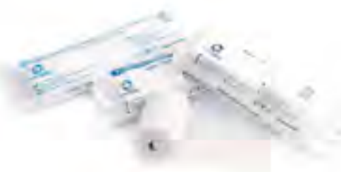
SB01 - Plaster of Paris Bandage Width: 5cm, 7.5cm, 10cm, 15cm, 20cm. Length: 2.7m, 3m, 3.6m, 4.6m, etc. Color: white. Weight: 360 - 420 g/m 2 . Material: gauze + gesso.