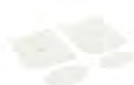
SE23 - Non-adhesive Eye Pad Size: 75x50mm, 80x60mm, etc. Color: white. Material: non-woven.