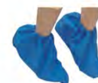
SJ30 - CPE Boot Cover Size: 24 x 38cm, 38 x 40cm, 40 x 50cm, etc. Color: blue, green, white, etc. Material: CPE. Weight: 10 - 30 g/pc.