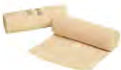
SA04 - Spandex Plain Bandage Size: 5cm x 4.5m, 7.5cm x 4.5m, 10cm x 4.5m, 15cm x 4.5m. Weight: 80g/m 2 . Color: natural white. Material: cotton + spandex.