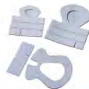
SE20 - PE Foam I.V. Dressing Size: 7.4x9.6cm, 6.3x7.3cm, 7.5x11cm, etc. Color: white. Material: PE Foam + glue.