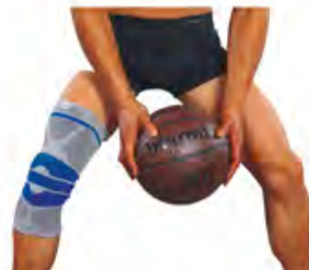
SM0403 - Knee Support with Metal Sping (silica gel) Size: S, M, L, XL. Material: nylon + latex + spandex + silica gel + metal sping.