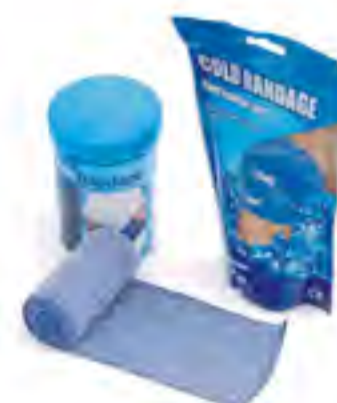
SB08 - Cold Bandage Size: 7.5cm x 3.2m, 10cm x 3.2m. Color: blue. Material: polyester + cotton.