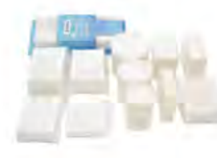
SH10 - Plastic Cotton Swabs Material: plastic stick + cotton tip. Size: 100pcs, 160pcs, 200pcs, 300pcs, 400pcs, 450pcs, etc. Packaging: PE bag, round box, square box, blister card, etc.