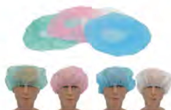
SJ01 - Bouffant Cap (Round Cap) Size: 18", 19", 21", 24", etc. Color: blue, green, white, pink, etc. Material: PP non-woven. Weight: 10 - 20 g/m 2 .