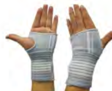
SM0605 - Hand Wrap Size: one size fits all. Material: polyester + nylon + latex.