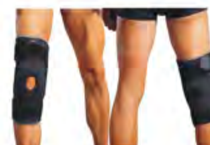
SM0510 - Knee Support with Aluminium Alloy Holder (neoprene) Size: one size fits all. Material: neoprene + nylon + aluminium alloy holder.