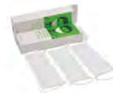
SJ09 - Paper Face Mask Size: 19 x 7cm. Ply: 1ply, 2ply. Color: white. Material: paper.