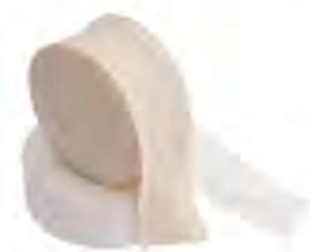
SB06 - Stockinet Bandage Width: A#(5cm), B#(7.5cm), C#(10cm), D#(15cm), E#(20cm), etc. Length: 20m, etc. Color: natural white, bleached white. Type: i) 100% cotton; ii) 100% polyester.