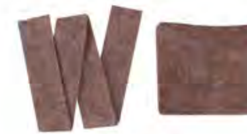
SF10 - Alginate Dressing with silver Size: 5x5cm, 10x10cm, 10x15cm, 10x20cm, 15x20cm, 2x30cm, etc. Material: alginate fiber + calcium ion + silver ion.