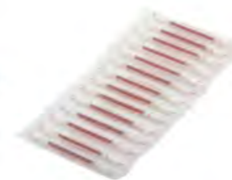
SI14 - Filling Povidone-Iodine Swabstick Size: ø5mm x 3", Packaging: 100pcs/bundle.