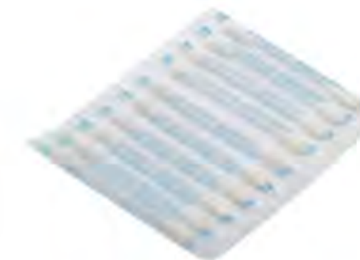
SI13 - Filling Alcohol Swabstick Size: ø5mm x 3", Packaging: 100pcs/bundle.