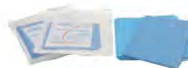
SK11 - Surgical Drape Size: 40 x 40cm, 50 x 50cm, 60 x 60cm, 75 x 75cm, 75 x 90cm, 100 x 100cm, etc. Color: blue, green, white, etc. Material: SMS, PP + PE, impregnated cloth + PE, etc.