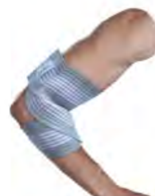
SM0602 - Elbow Wrap Size: one size fits all. Material: polyester + latex.