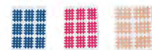
SE28 - Lattice Adhesive Tape (Cross Tape) Size: 22x28mm, 28x36mm, 44x52mm. Color: blue, pink, skin. Material: silk fabric + glue.