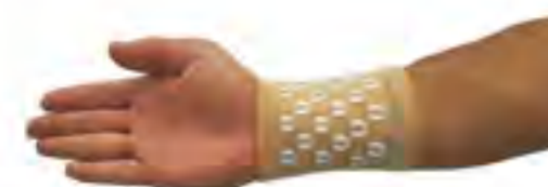
SM0701 - Wrist Support (far infrared ray) Size: S, M, L, XL. Material: polyester + latex + far infrared ray.