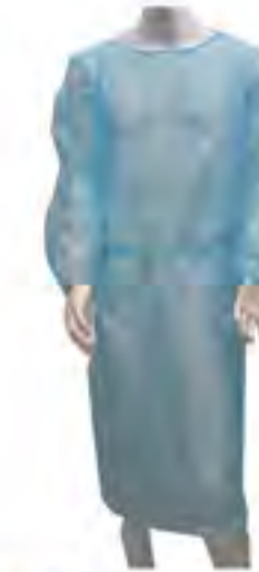
SJ16 - PP+PE Isolation Gown Size: 110 x 130cm(S), 115 x 137cm(M), 120 x 140cm(L), 125 x 145cm(XL), 130 x 150cm(XXL), etc. Color: blue, green, yellow, white, etc. Material: PP non-woven + PE. Weight: 20g/m 2 , 25g/m 2 , 30g/m 2 , 35g/m 2 , 40g/m 2 , etc.