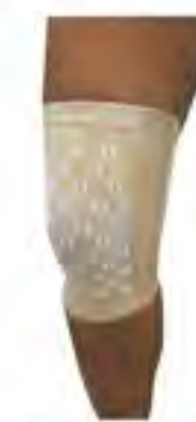
SM0703 - Knee Support (far infrared ray) Size: S, M, L, XL. Material: polyester + latex + far infrared ray.