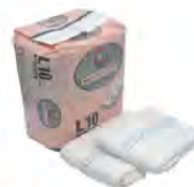
SK07 - Adult Diaper Size: 800 x 650mm(M), 900 x 750mm(L), 980 x 800mm(XL), etc. Color: white, etc. Material: PE+ non-woven + fluff pulp + SAP, etc. Weight: 90 - 120 g/pc. Type: with or without leg cuff, with or without wetness indicator.