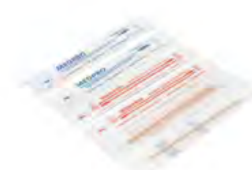
SH16 - Sterile Cotton Swabs (Single Tip) Type: wooden stick; plastic stick. Size: 15cm. Packaging: 1pc/pouch, 2pcs/pouch, etc.