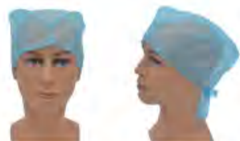
SJ03 - Doctor Cap (Surgeon Cap) - Tie Type Size: 64x13cm, etc. Color: blue, green, etc. Material: PP non-woven. Weight: 20 - 30 g/m 2 .