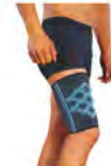
SM0306 - Thigh Support (pattern nylon) Size: S, M, L, XL. Material: nylon + latex + spandex.