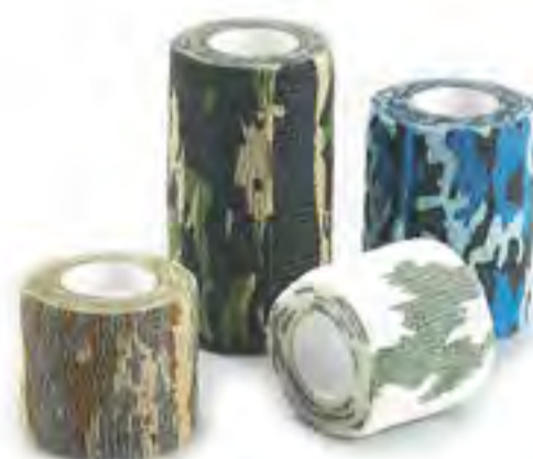
SC06 - Cohesive Elastic Bandage (Camouflage Type) Size: 2.5cm x 4.5m, 5cm x 4.5m, 7.5cm x 4.5m, 10cm x 4.5m, 15cm x 4.5m. Color: camouflage pattern. Material: non-woven + elastic yarn + glue.