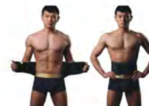
SM0506 - Waist Support (neoprene) Size: one size fits all. Material: neoprene + nylon.