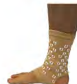
SM0704 - Ankle Support (far infrared ray) Size: S, M, L, XL. Material: polyester + latex + far infrared ray.