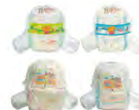
SK08 - Baby Diaper Size: 390 x 270mm(S), 450 x 320mm(M), 490 x 320mm(L), 525 x 340mm(XL). Color: cartoon pattern. Material: PE film or clothlike film + imported SAP + fluff pulp, etc. Weight: 19 - 42 g/pc. Type: i) PE film backsheet + PP tape; ii) clothlike film backsheet + magic tape; iii) clothlike film backsheet + elastic tape.