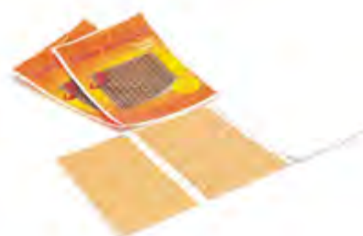
SF19 - Capsicum Plaster Size: 4x6.4cm, 10x18cm, 12x18cm, etc. Color: white, skin. Material: cotton fabric + capsicum, menthol, crystal, ginger, borneol, etc.