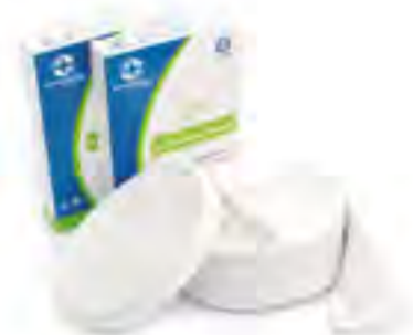
SA10 - Tubular Net Bandage Size: 0#(0.6cm), 0.5#(0.9cm), 1#(1.7cm), 2#(2.0cm), 3#(2.3cm), 4#(2.7cm), 5#(3.0cm), 5.5#(3.5cm), 5.8#(4.2cm), 6#(5.8cm), 7#(7.2cm), 8#(8.5cm), 9#(9.0cm), 10#(10cm). Color: bleached white. Type: i) polyester + rubber; ii) polyester + spandex.