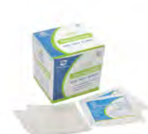
SG08 - Sterile Gauze Swabs Size: 5x5cm, 7.5x7.5cm, 10x10cm, 10x20cm, etc. Ply: 8ply, 12ply, 16ply, 24ply, 32ply. Edge: unfolded edge, folded edge. Mesh: 12threads/19x11mesh, 13threads/19x15mesh, 17threads/26x18mesh, 20threads/30x20mesh, etc. Color: bleached white. Material: 100% cotton (40's, 32's, 21's, etc). Type: i)without x-ray; ii)with x-ray. Individual packaging: 1pc/pouch, 2pcs/pouch, 5pcs/pouch, etc.