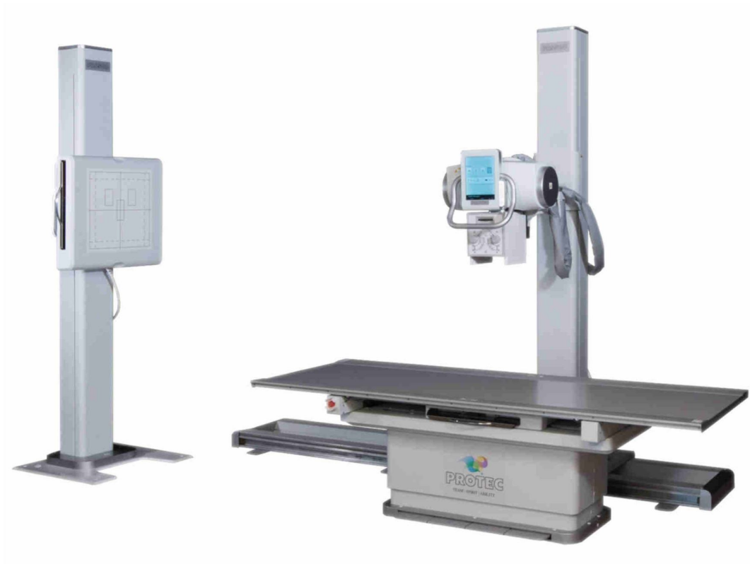
Fig.: Complete system PRS 500 B