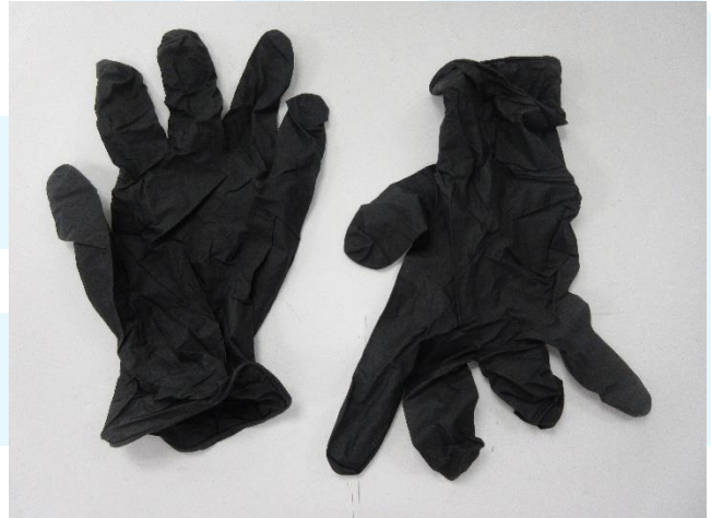
Samples described as Nitrile Powder Free Examination Gloves, ASAP NPF- Black X-Tra Thick Nitrile Powder Free 5.0g