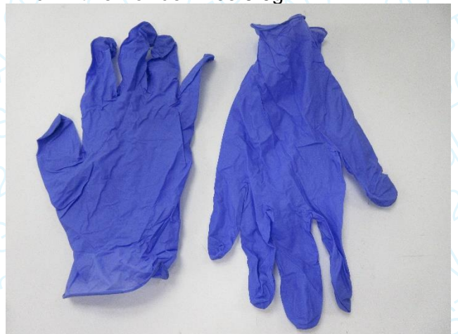
Samples described as Nitrile Powder Free Examination Gloves, ASAP NPF- Violet Blue Nitrile Powder Free 3.5g