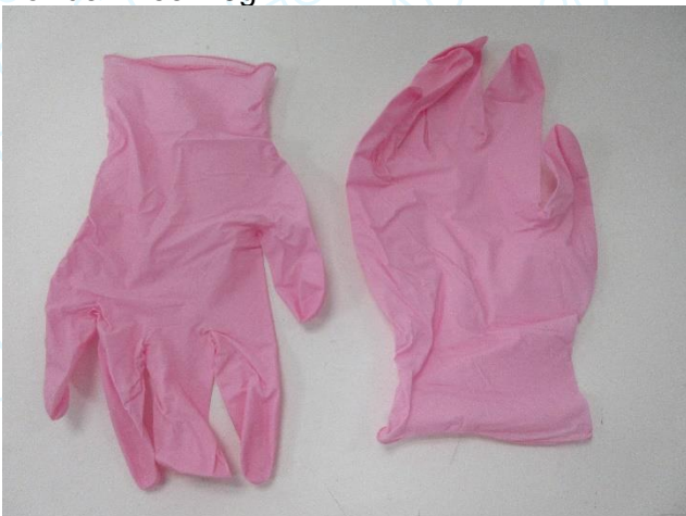
Samples described as Nitrile Powder Free Examination Gloves, ASAP NPF- Pink Nitrile Powder Free 3.8g