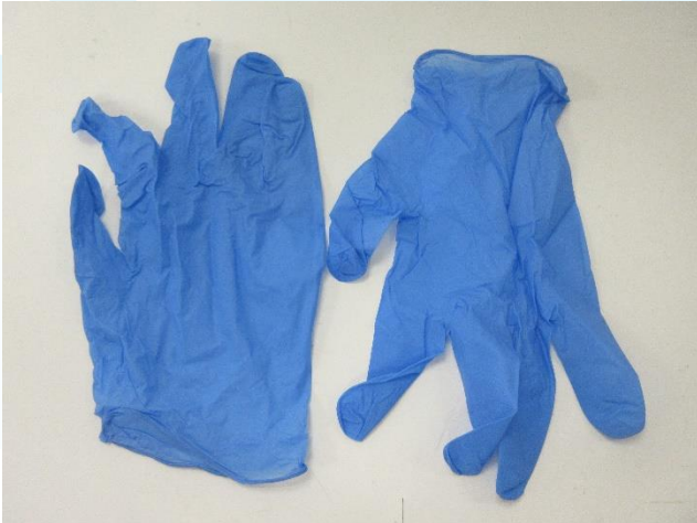
Samples described as Nitrile Powder Free Examination Gloves, ASAP NPF- Blue Nitrile Powder Free 2.5g