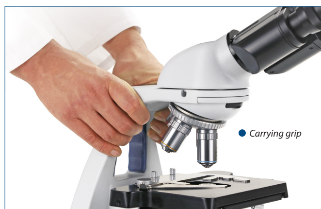
● Carrying grip