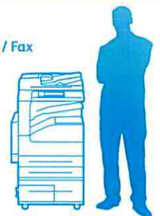
WorkCentre 5335 with High-Capacity Tandem Tray

WxDxH: 23.5 x 25.1 x 43.9 in. 597 x 637.5 x 1,115 mm