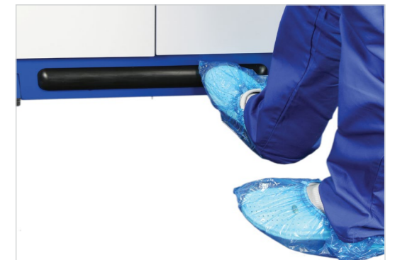
Foot pedal allows hands-free door lid opening and closing