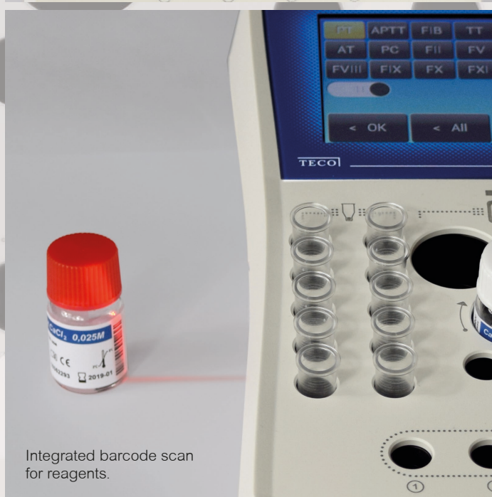
Integrated barcode scan for reagents.