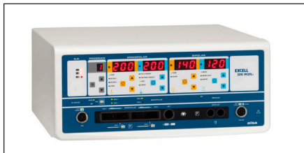
EXCELL 200 MCDSe