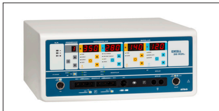
EXCELL 350 MCDSe