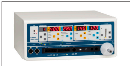
EXCELL 400/A MCDSe