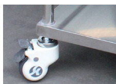
Noiseless castors with brake