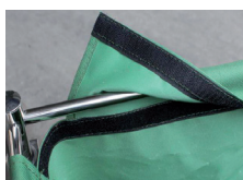
Velcro for canvas bag