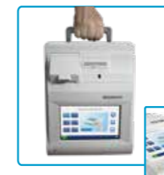
Portable and lightweight