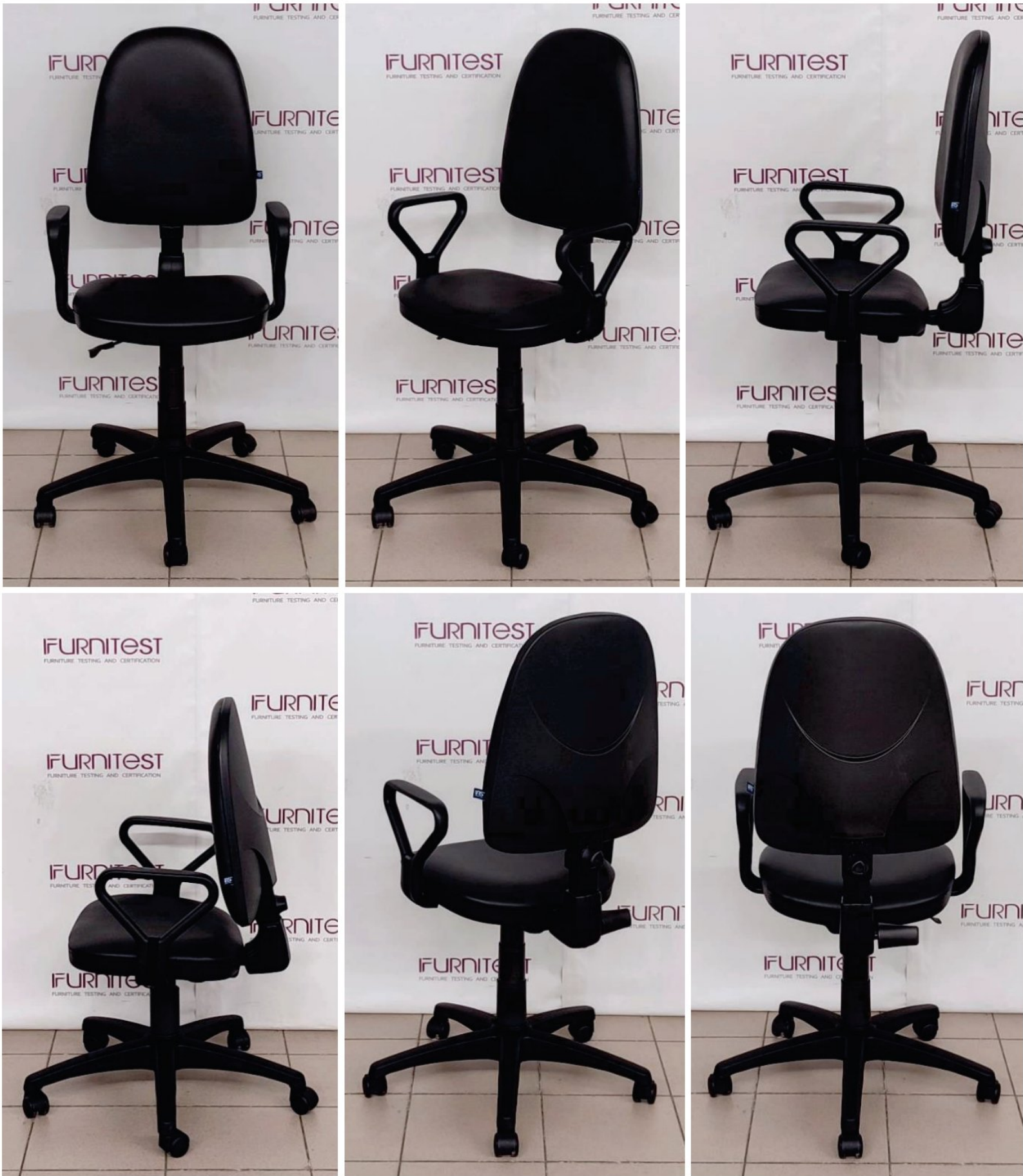
Figure 1. Chair PRESTIGE II GTP (FI 640) (SENC