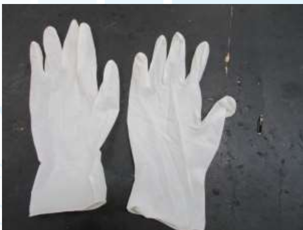
Gloves described as Latex Powdered Gloves (011340274)

This document and its contents are confidential of Sri Trang Gloves (Thailand) Public Company Limited only. Do not copy, discuss with or give to people not designated