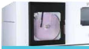
OPTIONAL GRAPHICAL CHART RECORDER