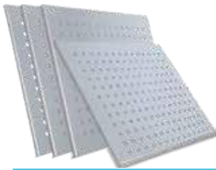
OPTIONAL CHROME SHELVES