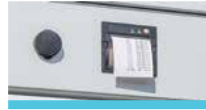
OPTIONAL THERMAL PRINTER