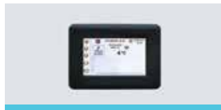
OPTIONAL TOUCH SCREEN DISPLAY