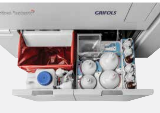
Small footprint allows built-in redundancy