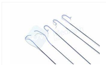
Radiology Angiographic Catheter