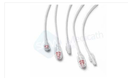
High Pressure Tubing