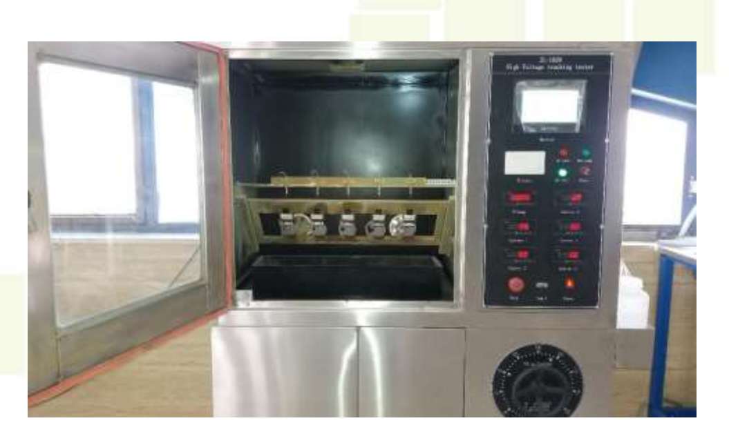
Figure 4: Tracking Machine Tester