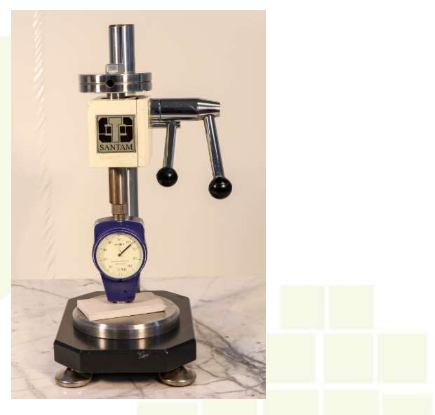
Figure 3: Shor<mark>e A Dur</mark>ometer