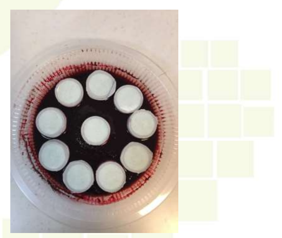
Figure 2: Schematic View of Dye Penetration Test

Result of Test: according to figure 2, no dye rise through the specimens before the 15 minutes have elapsed.