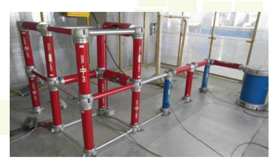
Figure 8: Equipment of Lightening Impulse Voltage Test