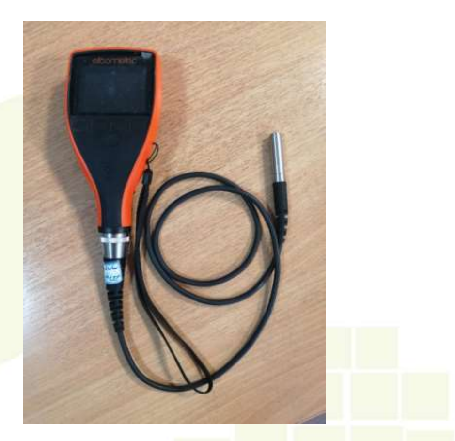
Figure 7: Equipment Used for Coating Thickness Measurement