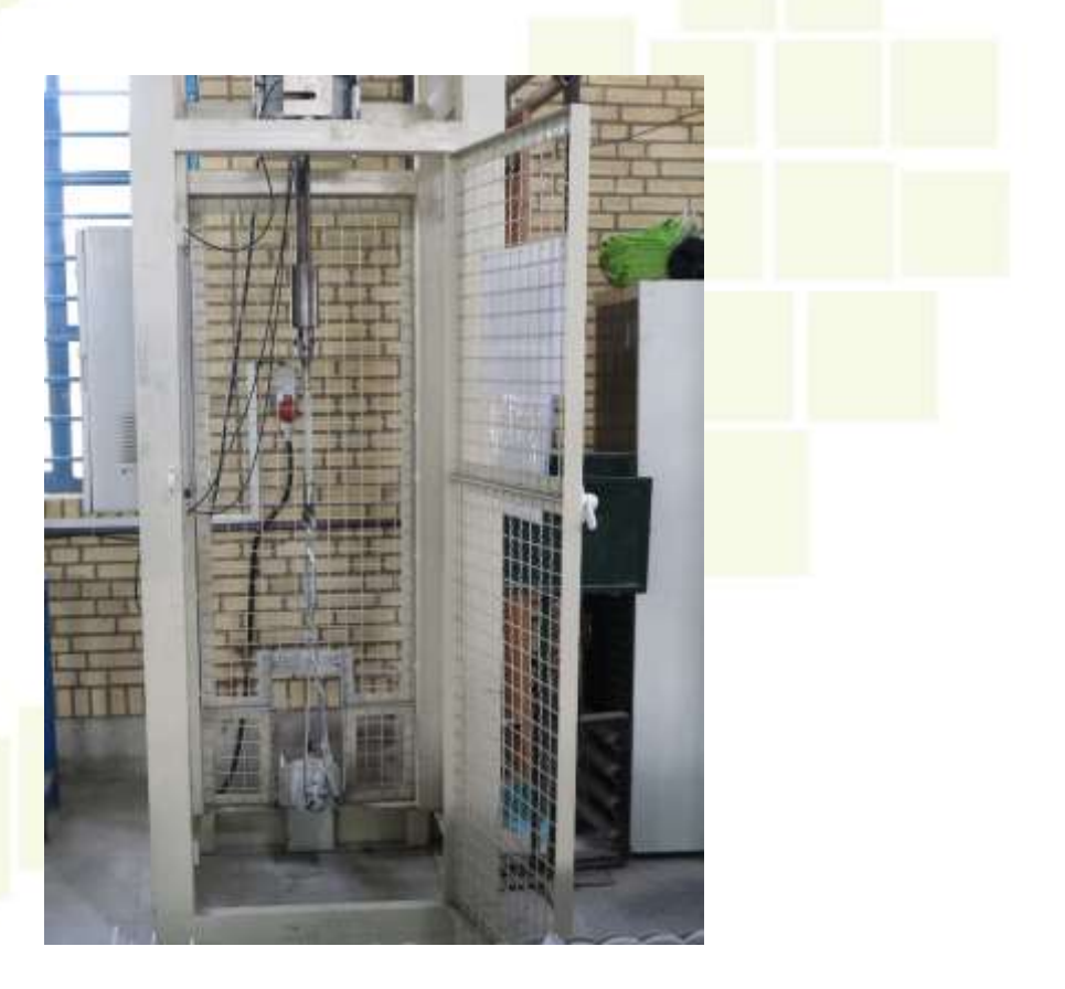
Figure 10: Cantilever/ Bending Test Machine

Company laboratory: Block E2-79, Shiraz Especial Economic Zone (SEEZ), Fars, Iran.