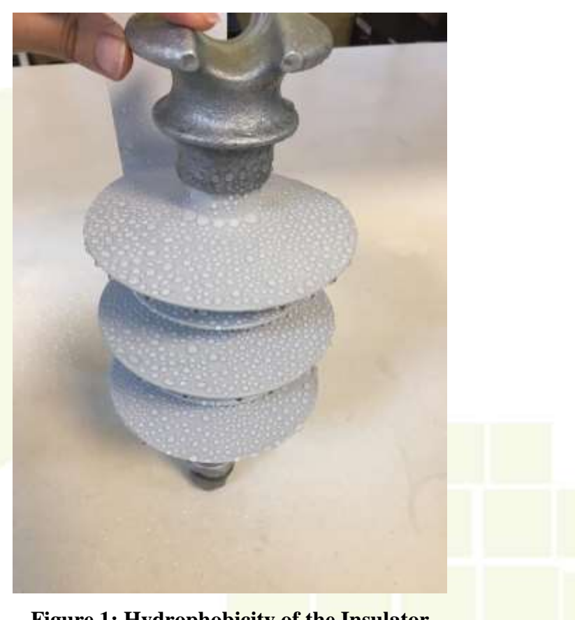
Figure 1: Hydrophobicity of the Insulator