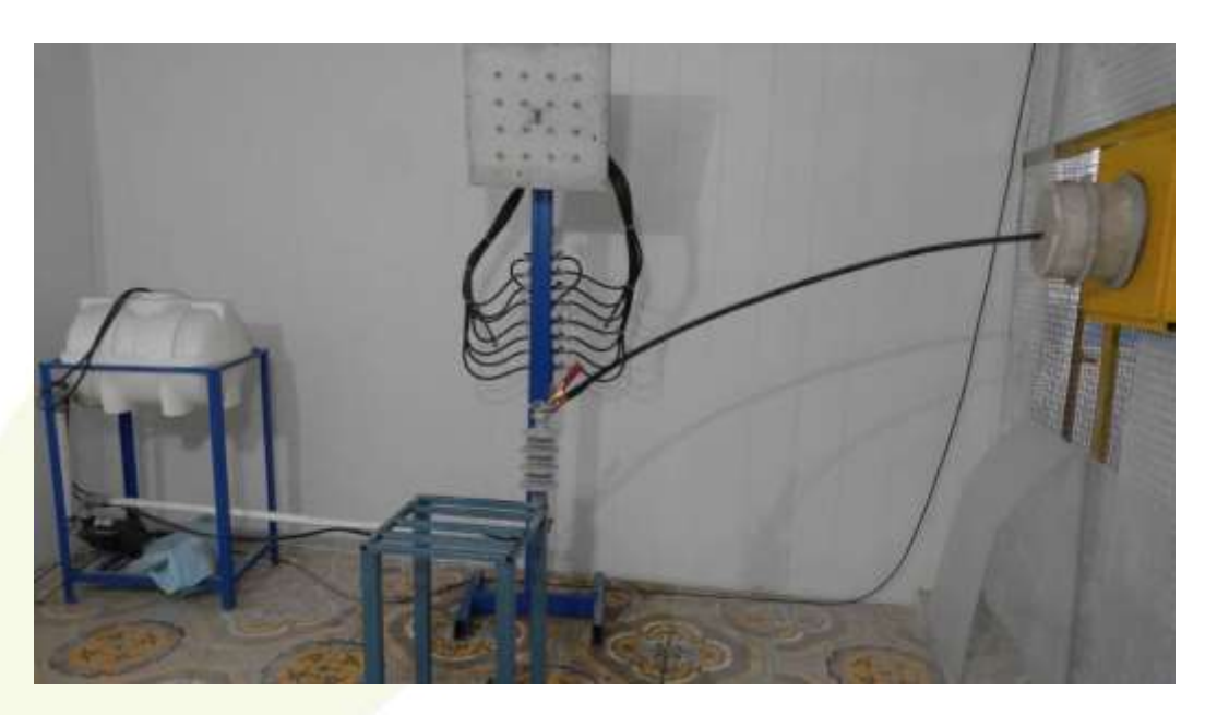
Figure 9: Wet Power Frequency Voltage Test Chamber