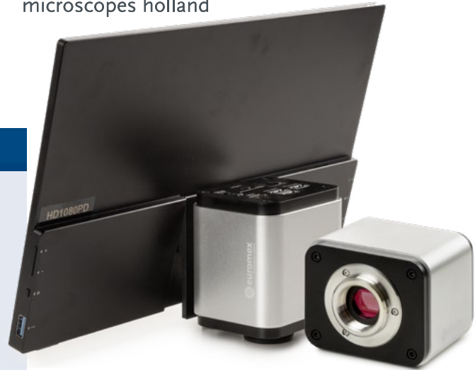
● VC.3045 / VC.3045-HDS