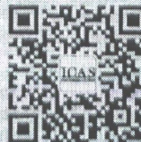
Focus on icas WeChat platform

Certification and Accreditation Administration of PRC,CNCA-R-2003-117 Tel: 400-182-9001/+86 21-51114700 Web: www.icas.org.cn Add: Room 601 HuaDing Mansion, 2368# West Zhongshan Rd., Xuhui District, Shanghai, China, 200235