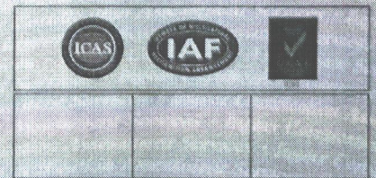
First Surveillance Audit Second Surveillance Audit Third Surveillance Audit

The ownership of the certificate belongs to Shanghai Ingeer Certification Assessment Co., Ltd. The information & validation of this certificate can be checked on the CNCA website: WWW.CNCA.GOV.CN and ICAS website; or by calling ICAS's clients services Dept. The certificate is only valid when used together with related permits when appropriate. If the organization can't effectively maintain the above management system, ICAS has the right to withdraw the qualification certificate.