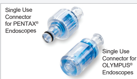
Single Use Connector for PENTAX® Endoscopes