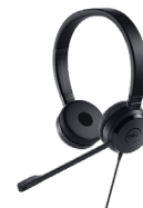
DELL PRO STEREO HEADSET - UC350

Ensure your valuable information is kept private, without compromising screen clarity. Meet new standards in protection with this anti-glare privacy screen that also filters blue light.