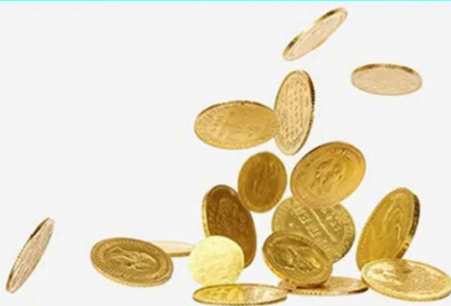
One coin 0~90mm