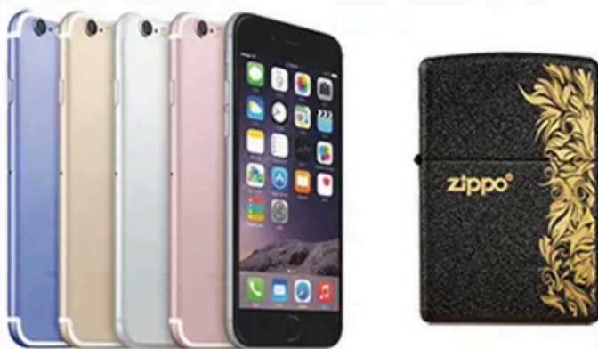
Mobile phone lighter 0~150mm