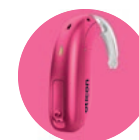
C057 Power Pink