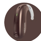
C093 Chestnut Brown