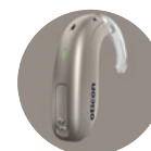
C090 Chroma Beige