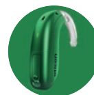
C048 Emerald Green