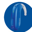
C047 Cool Blue