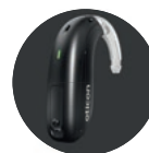
C063 Diamond Black