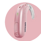
C079 Baby Pink