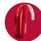
C046 Cool Red