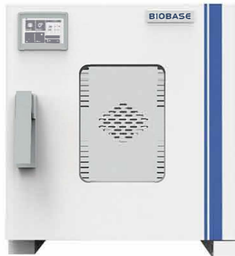
Glass Viewing Window Door (G type)