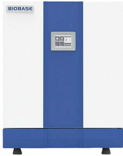
Double-layer Door (D type)