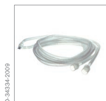
VentStar® MRI (N) 300

Disposable neonatal breathing circuit, consisting of 2 smoothbore hoses (Ø 10 mm), angled Y-piece with LuerLock.