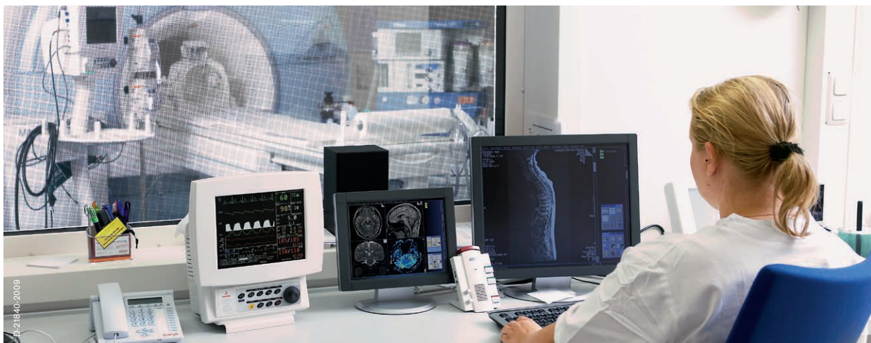
MRI Suite and control room

The cockpit's view from the operator control area. Everything in view and under control.