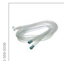
VentStar® MRI 300

A wide array of MRI conditional accessories and consumables are available to choose from, giving you the possibility to tailor the Fabius® MRI to create exactly the anaesthesia solution you need: