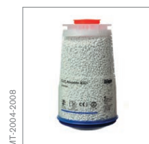
CLIC Absorber 800+

Spirolog Flowsensor is a hot-wire sensor for measuring volumetric gas flow delivered by Dräger anaesthesia devices and ventilators.