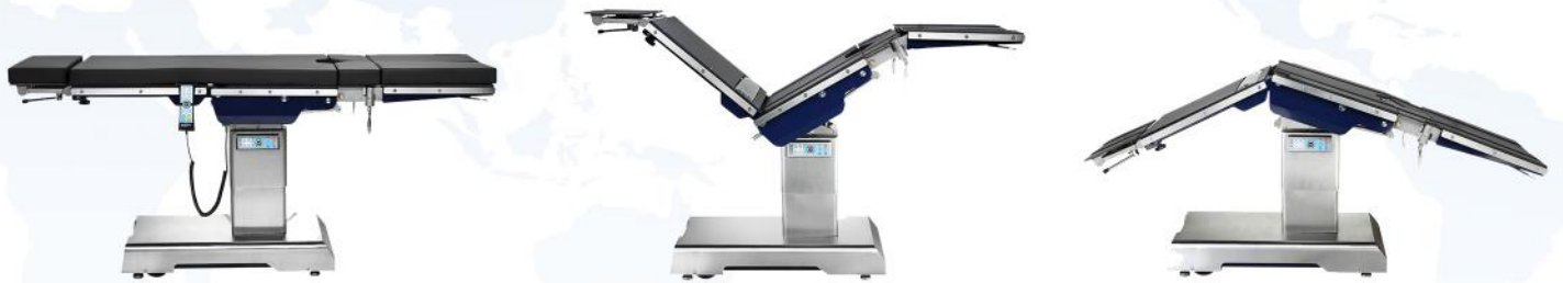
Electro-Hydraulic Operating Table