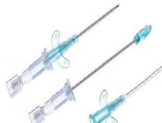
Polywin Plus Safety