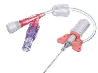
Nouovo Safety Set