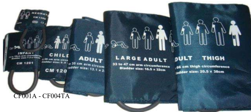
CF001A - CF004TA