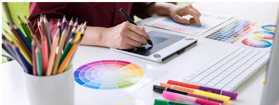
Eye-popping color. Fine detail. A perfect plan for business success.