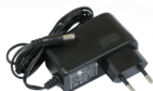
24 V 0.38 A power adapter