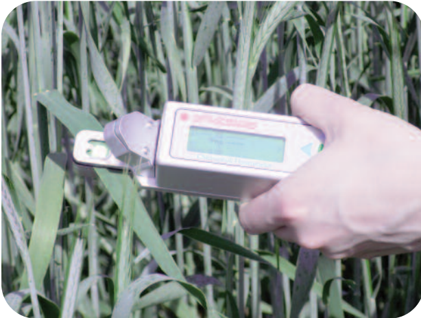
Also sold separately

Measure both light adapted Quantum Yield of PSII or Y(II) and dark adapted Maximum Potential Quantum Efficiency of PS(II) or F_v/F_M with these two fluorometers in one kit. Also sold separately.