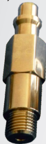
DIN 13260 Standard Probe