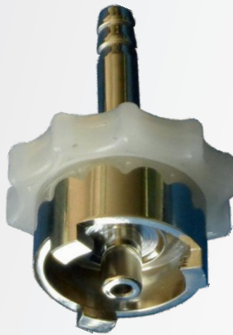
NF S 90-116 Standard Probe