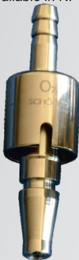
BS 5682:2015 Standard Probe