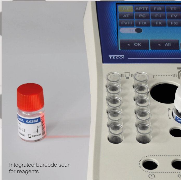
Integrated barcode scan for reagents.