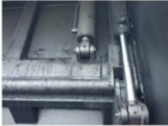
Xiamen Yinhua hydraulic cylinder oil leakage leakage for free