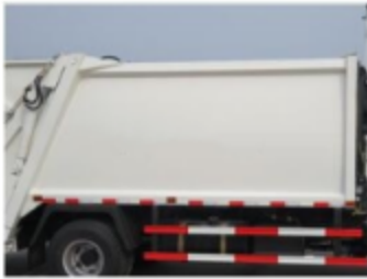
New curved box body, integrated ending to reduce welding seam, spray patterns and words according to user