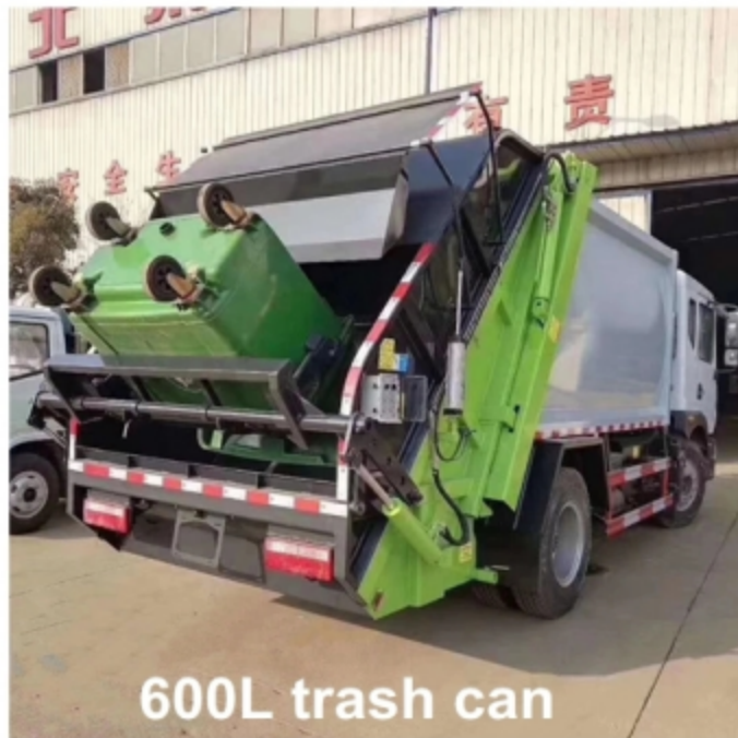
600L trash can