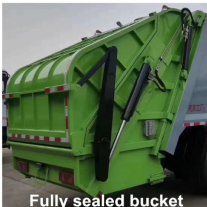
Fully sealed bucket