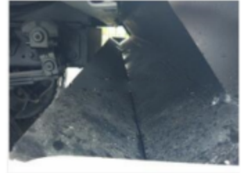
Sewage collection box, new diversion channel, anti-slag design, walking