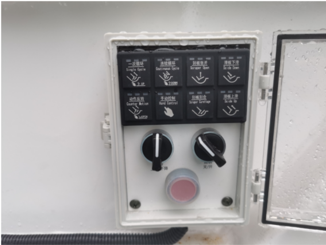
Cabin control system