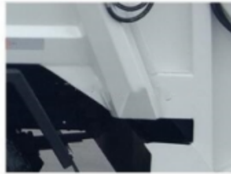
Super thick special rubber strip + water guide and water retaining edge, hydraulic tightening and locking.