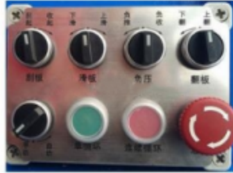
Adopt electric control + manual dual control system, install PLC one key