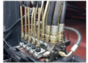
Brand multi-way valve, stable performance, low failure rate, optional double pump double valve