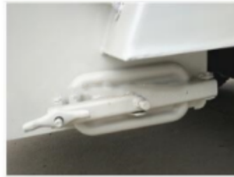
Large-volume sewage tank at the rear, new ultra-wide sewage outlet, easy to operate without clogging