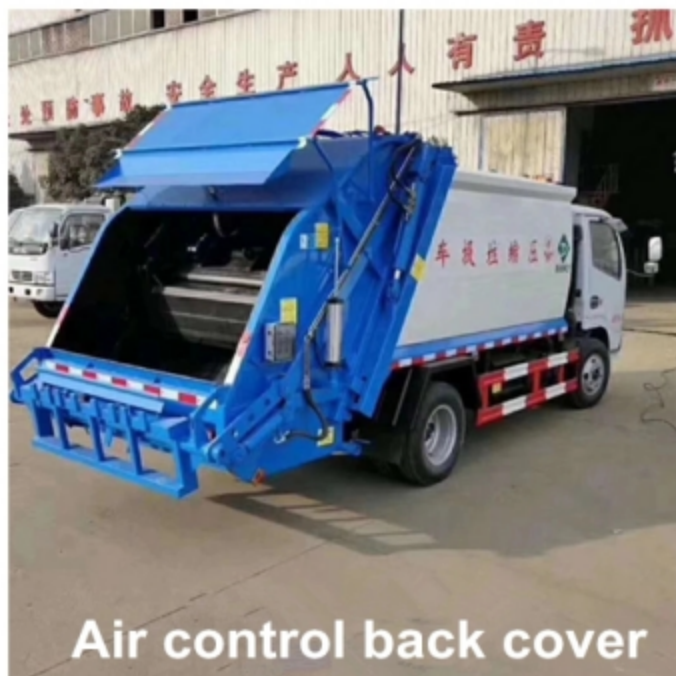
Air control back cover