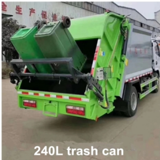
240L trash can