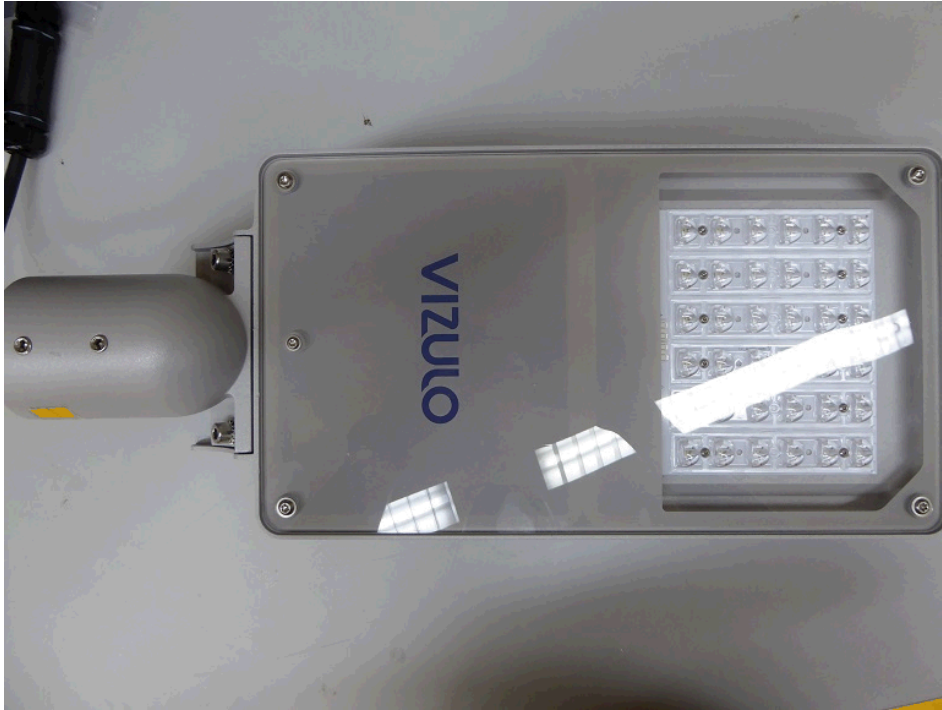
Figs. 1 and 2 – front side of MINI MARTIN luminaire (back side (not shown) consists of an aluminium housing).