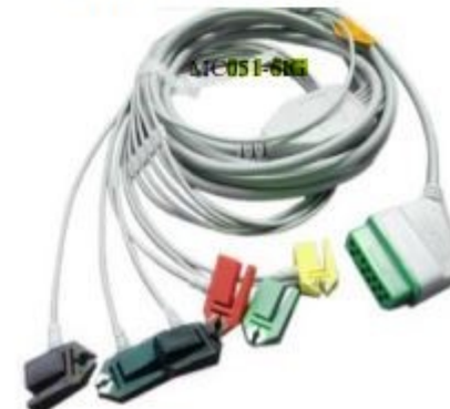
Nihon Kohden Compatible ECG cable with leadwires