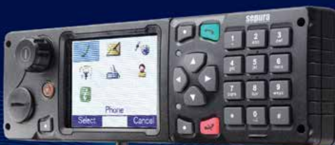
SCC BLACK BEZEL