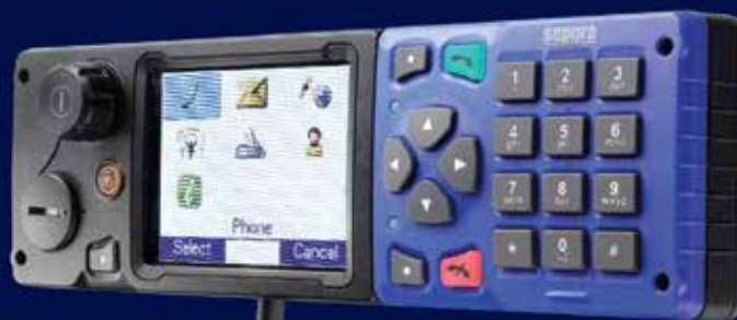
SCC BLUE BEZEL