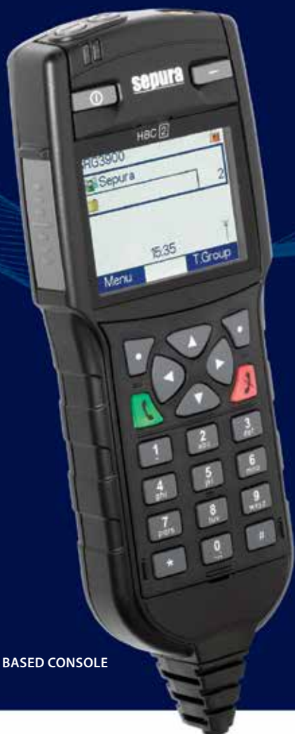
HANDSET BASED CONSOLE