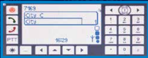
VIRTUAL CONSOLE SCREEN