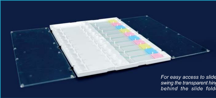
For easy access to slides, simply swing the transparent hinged cover behind the slide folder base.