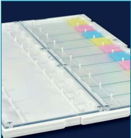
Clear hinged covers protect the slides from environmental effects and offer clear visibility of the slides.