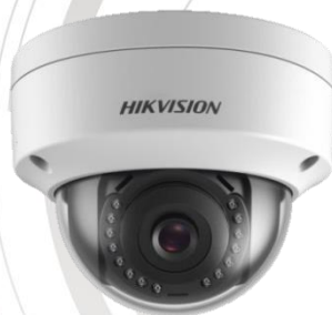
2.8 mm Fixed Focal Lens