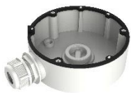
DS-1280ZJ-DM18 Junction Box