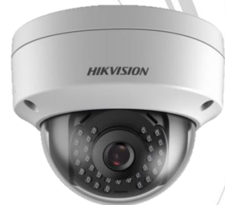
Non 2.8 mm Fixed Focal Lens