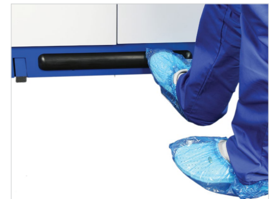
Foot pedal allows hands-free door lid opening and closing