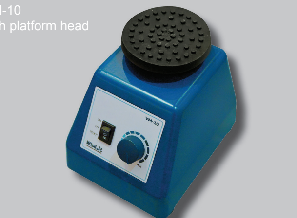
VM-10 with platform head

up to 3,300 rpm, orbital shaking motion, multiple heads available