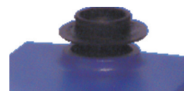
Pop-off cup head PM210