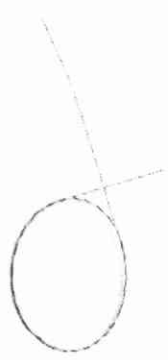
Zebra Guide Wires