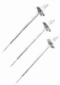
Peelable Introducer Sets