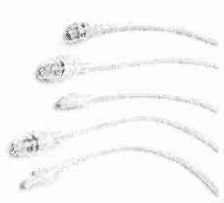
High Pressure Tubing