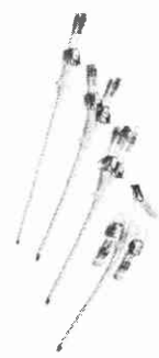
Hemodialysis Catheterization Kits