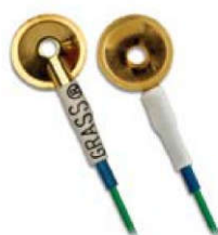
Heavy 24k Gold plate over pure silver cast cup