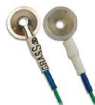
Pure, solid Silver cast cup, burnished for a smooth finish