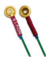
Heavy 24k Gold plate over pure silver